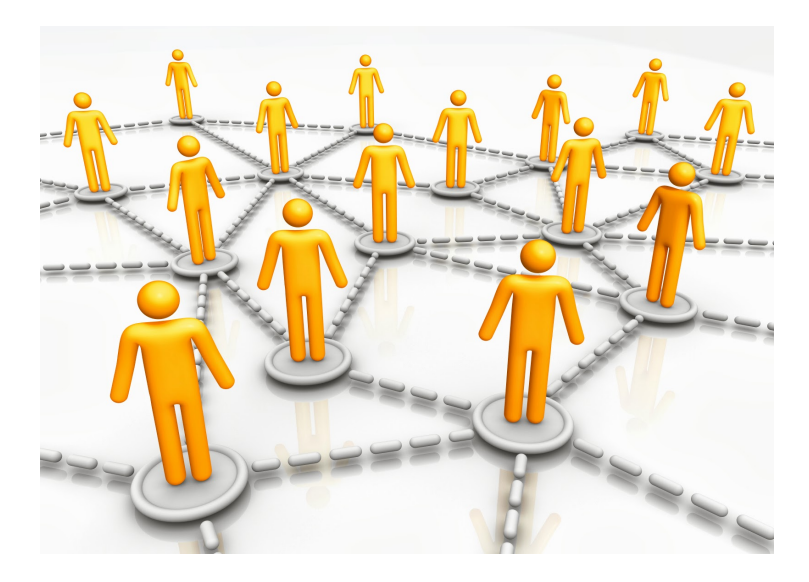
Figure 2. Distributed Leadership Model to Sustain Resiliency Initiatives

It seems self-evident that the more people who are involved in leading resiliency-enriching initiatives, the more initiatives can be offered. Also, if more initiatives are offered to students, more students are likely to engage in the initiatives because they are more likely to find strategies that interest them and address their needs.