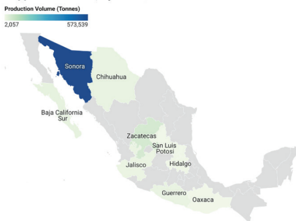
Copper Production, By State | Mexico

Map: Extractive Resource Governance Program • Source: Sistema Integral sobre Economía Minera, 2018 • Map data: © OSM • Created with Datawrapper