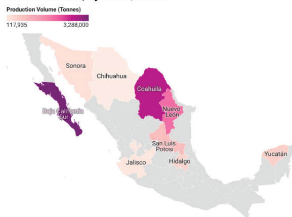
Zinc Production, By State | Mexico

Map: Extractive Resource Governance Program • Map data: © OSM • Created with Datawrapper