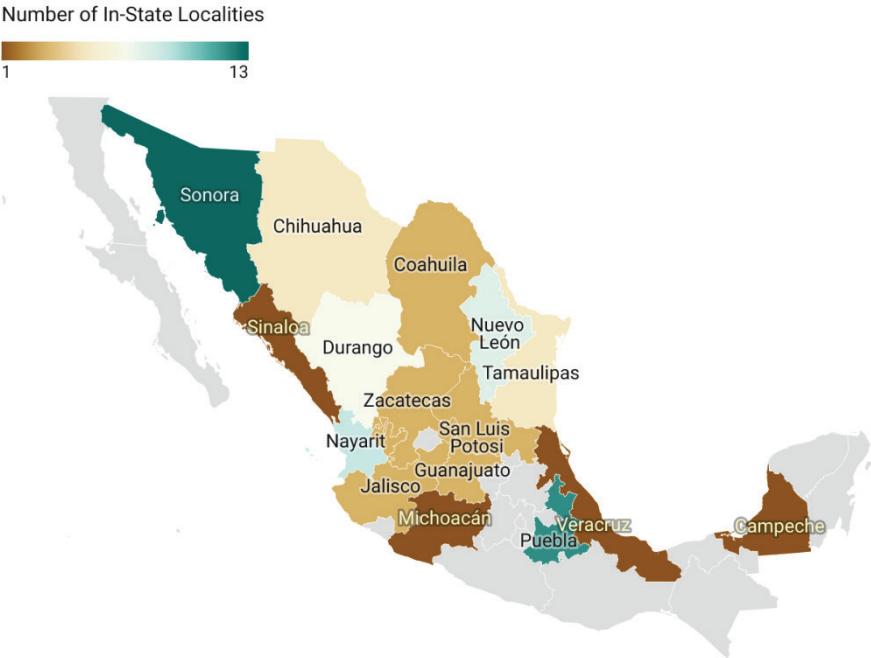
Map: Extractive Resource Governance Program • Source: Servicio Geológico Mexicano, 2021 • Map data: © OSM • Created with Datawrapper

Recent moratoriums and exploration restrictions pose a unique challenge that Canada and its private miners have not faced in their existing relationship with Mexico, to date. Advancement toward clean energy vehicle supply chains in North America depends on changes within the mining industry and within the USMCA, which includes a protectionist element within its trilateral relationship.