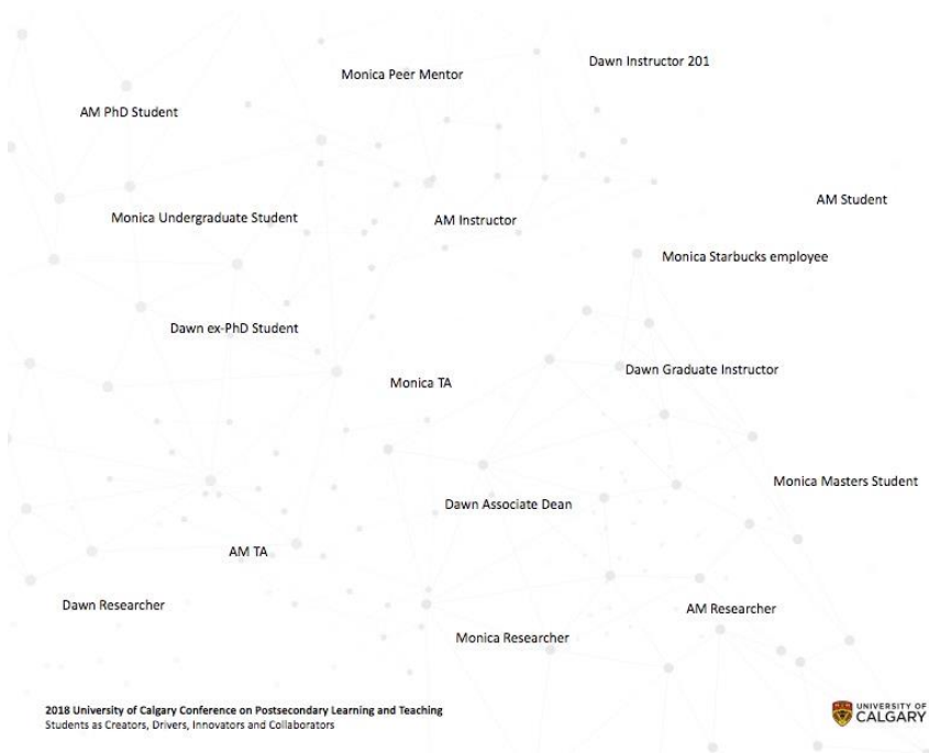
Figure 1. Movements in mentorship identity mapping stage one.