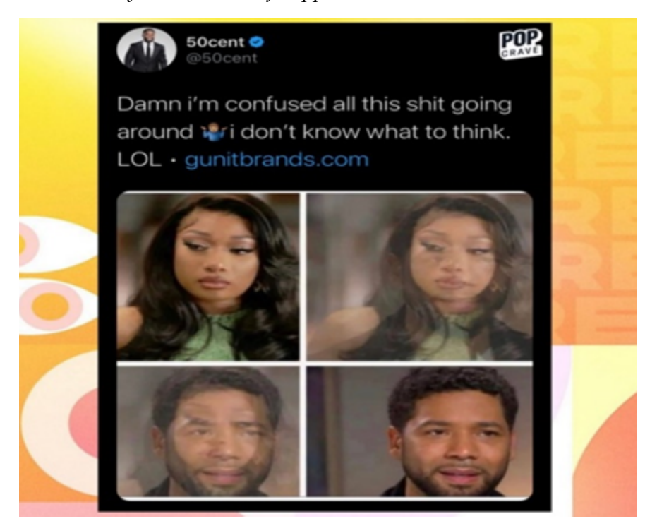
Figure 2 Screenshot of meme-tweet by rapper, 50 Cent

is not given the same level of concern as their male and/or white counterparts. Referring back to Scott's points, I argue that these memes that made fun of and accused Stallion of lying about her situation also served as additional evidence of anti-fans' dislike of Stallion and why she could not be considered a "real" artist in the Hip-Hop industry – which is notably male-dominated. These memes were a way for anti-fans to try to push Stallion and her majority-female fanbase out of Hip-Hop.