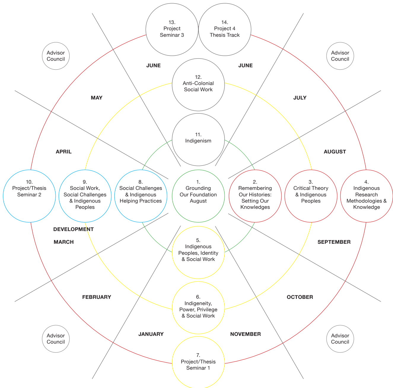
FIGURE 2: THE PROGRAM STRUCTURE