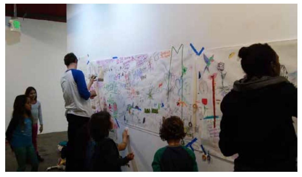
Figure 4. Graffiti Board artwork