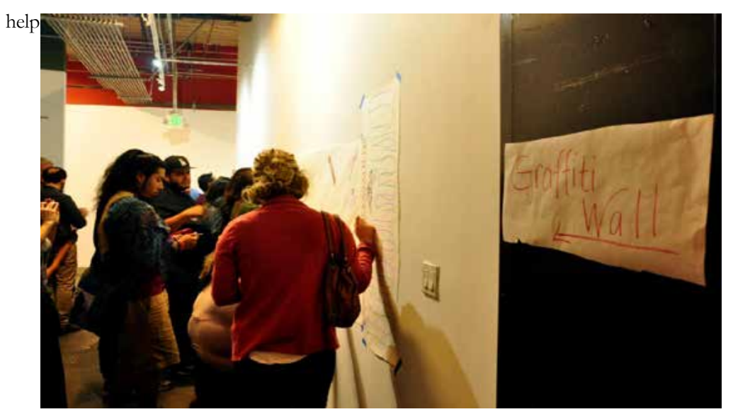
Figure 3. Graffiti Board in action