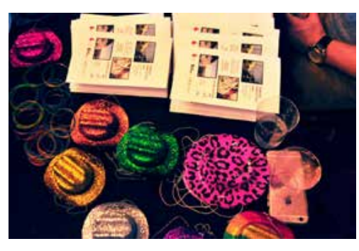
Figure 1. Books featuring Artists' Biographies

Recruiting and interviewing participants. Our research team was made up of faculty and student researchers. They represented members of the LGBTQ community and allies. With the assistance of our CAB members, we engaged in outreach to various social service organizations and tabled at a drop-in center at a large organization in LA. We also reached out to LGBTQ-oriented and foster care alumnae campus groups and centers, list servs, and social media, spreading the word about the purpose of our photovoice project with LGBTQ former foster youth. Through purposive and snowball sampling, we were able to recruit a total of 25 LGBTQ former foster youth who participated in this project. These youth participated in in-depth qualitative interviews, which lasted from one to three hours. Participants were asked questions related to family history, foster care placements and transitioning out of care, educational experiences, mental health, substance abuse, LGBTQ identity and coming out,