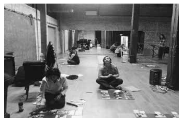
Figure 2. Decision-making process for photos featured in art exhibit<sup>1</sup>

engage the participants in the power of self-representation, most of the youth wrote the artist-biographies that would accompany their photographs in a community-based art exhibit. The participants who preferred to have one of the researchers write their biography had the opportunity to review how their intersecting identities would be presented in their artist-biography. It was crucial for us to place the power of representation in the hands of the participants. The artist-biographies provided a context for