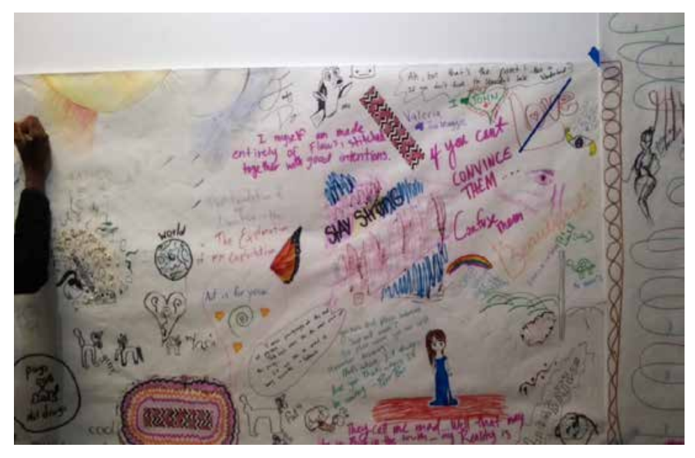
Figure 5. Graffiti Board artwork