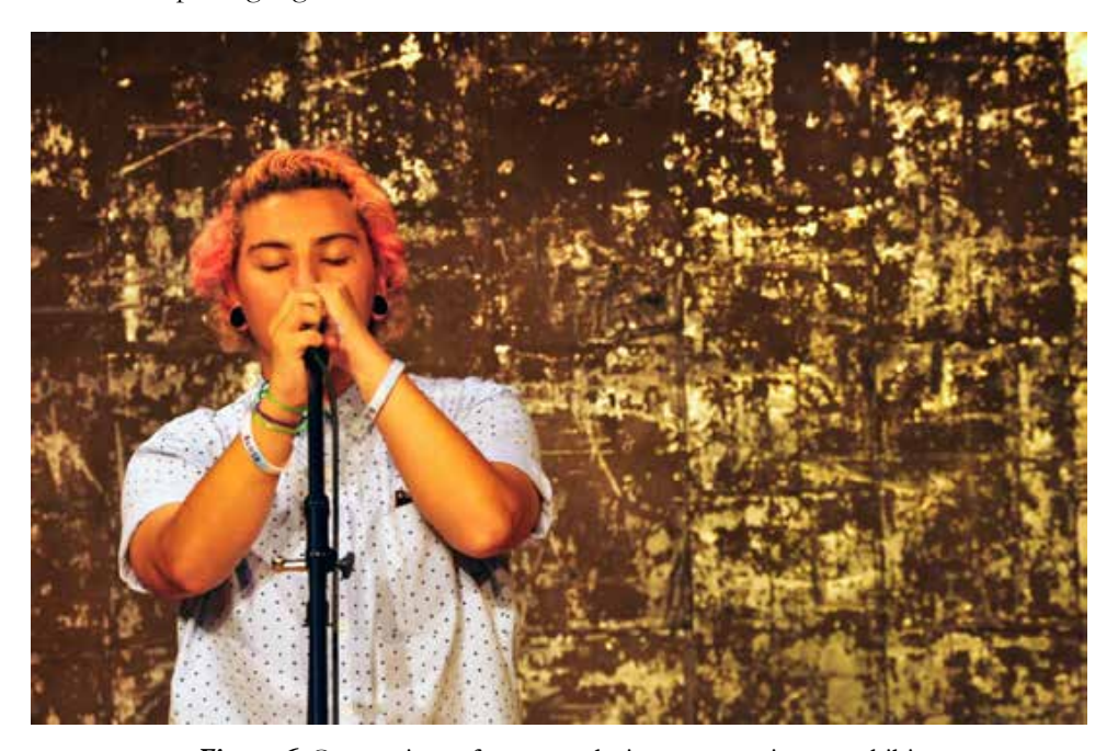
Figure 6. Open mic performance during community art exhibit

Ambassador felt strongly that there should be a red carpet at the entrance to honor and welcome the youth into the show. Sure enough, there was a red carpet lining the way to the exhibit on the opening night of the show.