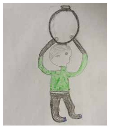
Figure 11. Boy carrying water

Many of the drawings depict girls and women assuming roles typically performed by boys and men, and vice versa. Figures 16 to 21 show boys and men performing tasks typically undertaken by girls and women. In each of these drawings, the objects (pots, baskets, jerry cans, homes, clothes, crops, landscape, brooms, etc.) featured were all familiar to all participants and representative of the context of rural North West Uganda, as were the actions associated with them.