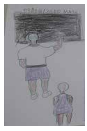
Figure 5. Boy doing math calculations; girl in background

A number of drawings depicted the many ways that girls' educational opportunities are compromised by neglect and exclusion in the classroom context. The following drawings speak powerfully to the argument that access to schooling is not enough to bring about gender equality in education (Jones, 2008; 2011). Girls are entitled to quality of education and educational experiences and the same (if not more, given the long history of discriminatory practices that have perpetuated their marginalized positions in society) opportunities as boys, such as attention from, and support by teachers, access to resources, leadership positions, freedom to play and rest outside of class time. However, disparities between girls' and boys' experiences at school are starkly depicted in the drawings following.