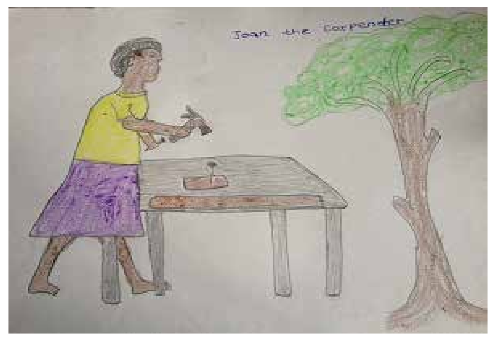
Figure 18. Female carpenter

These drawings of girls and women performing work usually considered the domain of boys and men again communicate meaning beyond the surface level of the images. Aspects of