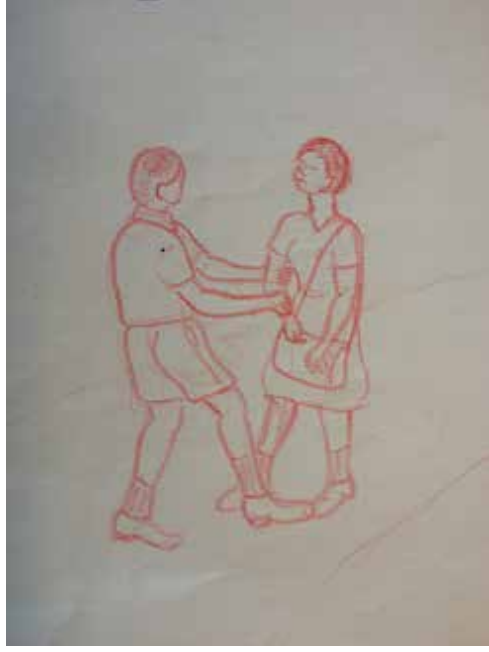
Figure 2. A boy assaulting a girl

Figure 2 conveys similar messages as Figure 1 with respect to boys' fear of girls' academic success. However, as discussed by the participants, the reference to speaking English is an important aspect of the reflective description. Fluency in English is representative of power,