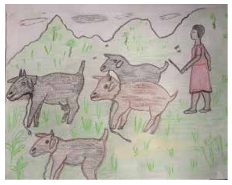
Figure 16. Girl grazing goat