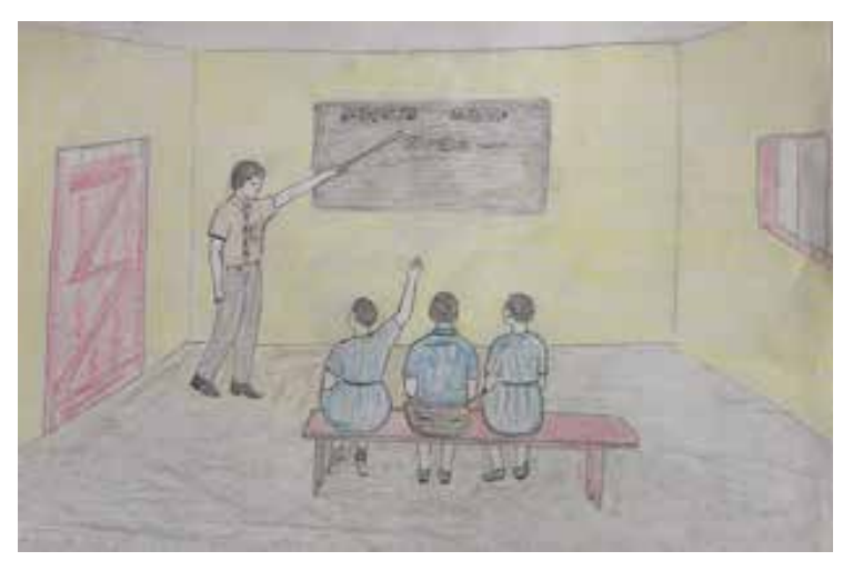
Figure 22. Students in a math class

Figure 23 features girls and boys equally sharing in responsibilities, chores, and play around the school.