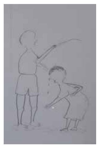
Figure 1. Boy beating girl with stick

Figure 1 depicts a theme that was common to many of the drawings-a boy beating a girl.