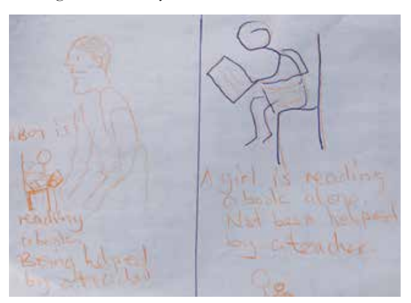
Figure 7. Contrast of attention given by teacher to boy and girl

Figure 7 directly contrasts the attention received by a boy and a girl from their teacher.