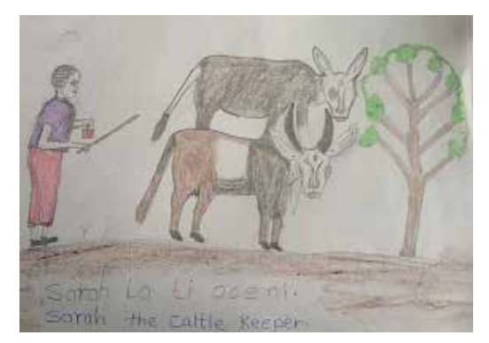
Figure 17. Female cattle-keeper

Many families have some kind of livestock, and it is typically the boys' responsibility to feed and care for the animals. One of the striking aspects of Figure 17 is that the girl is wearing trousers. This is almost never seen, and in this context makes a radical break with gender norms.