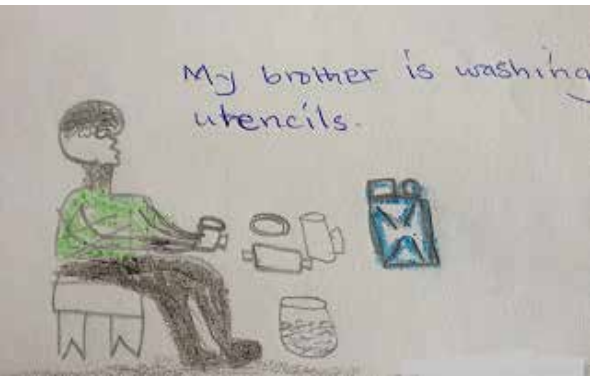
Figure 13. Boy washing dishes

At a surface level, these drawings depict boys and men doing the tasks normally assigned to girls and women. However, in the shared context of the participants, who were intimately familiar and experienced with these tasks, a deeper and more complex meaning was represented. For example, all the participants understood the intense effort, enormous amount of time, and drudgery involved in transporting water in jerry cans over long distances several times a day. Even though this is the task of girls and women, most boys and men have had to do this at some point in their lives and so they appreciate how difficult it is. Almost all the tasks are focused on the home, domestic work and caring for others, or very specific movement to and from a designated destination (water source, market). Thus, the visual representations of the objects, as well as the subjects' interactions with then, offers a sensory immediacy and imprinting that reaches beyond words.