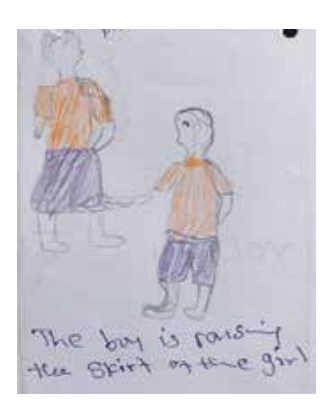
Figure 3. Boy lifting a girl's skirt

The accompanying summary of this drawing, however, reveals a message that extends beyond the simple image: