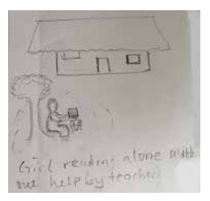
Figure 8. Girl reading alone

The creator's full summary of the drawing reads: "Girl reading alone without help by teacher. In some schools teachers tend to help boys in their studies more than girls. Girls were not given opportunities [in] other areas especially leadership, and their rights area abused..."