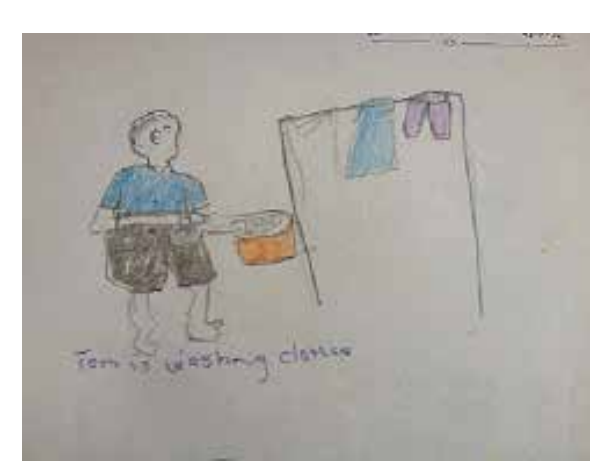
Figure 12. Boy washing clothes

There are no washing machines in areas with no electricity and so girls and women must wash all clothes by hand, using scarce water resources. This is a daily activity that requires a significant amount of time. In this drawing, the boy is washing the clothes.