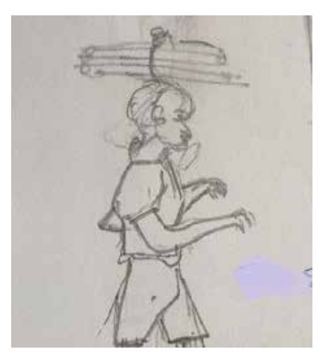
Figure 14. Boy carrying firewood