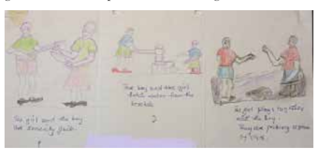
Figure 23. Girls and boys engaged in activities around school

Figures 21–23 offer representations of imagined gender equality, and healthy, positive gender relationships. There is a strong sense of collaboration, camaraderie, and mutual respect.