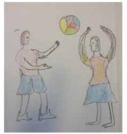
Figure 21. Girl and boy playing netball

One female teacher noted in her reflection: "...[as] female teachers, we are supposed to guide, counsel, care, advise, whenever they [girls] are in problems...so that they aim high become somebody."