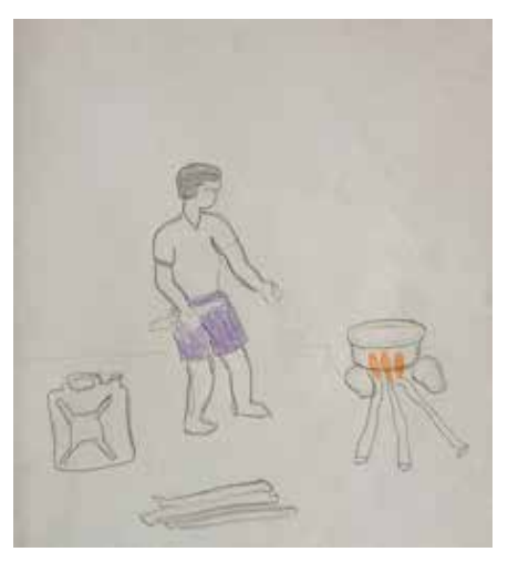
Figure 15. Boy cooking