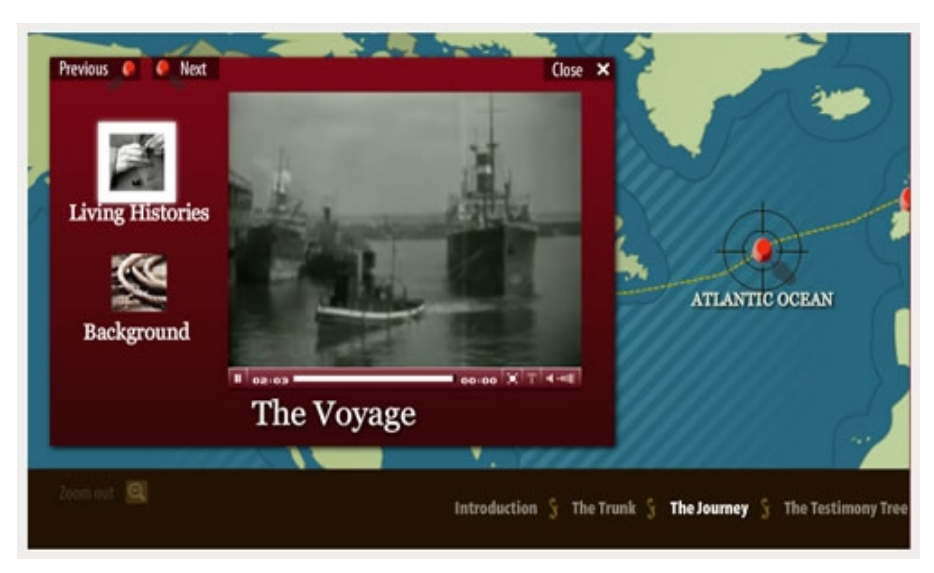
Figure 5: The Journey