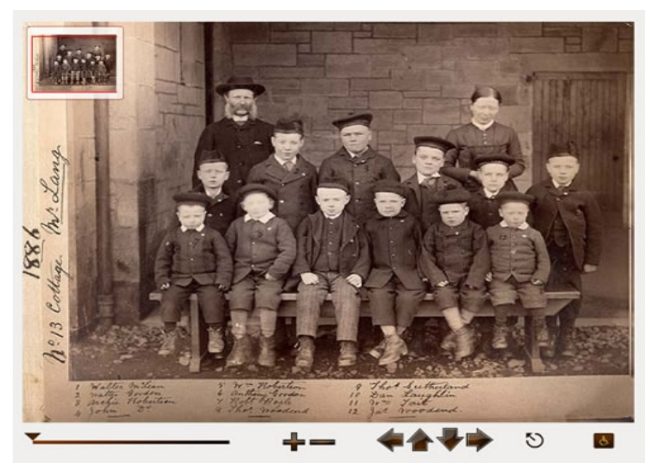
Figure 2: Historic Photograph

includes a Photo Gallery that opens to reveal thumbnails of 58 images sorted into six categories. When selected, individual images appear in a window where they can be panned and zoomed, offering a unique viewing experience similar to examining a high-resolution image with a magnifying glass. The viewer is able to appreciate detail that might have been missed using a more conventional static image display (figure 2).