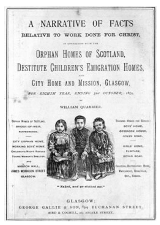
Figure 1: A Narrative of Facts

There are 38 display copies of the Narratives of Facts for the years from 1872 to 1910. The objective here was not to enhance or 'clean-up' the original Narratives of Facts, but to capture the original content