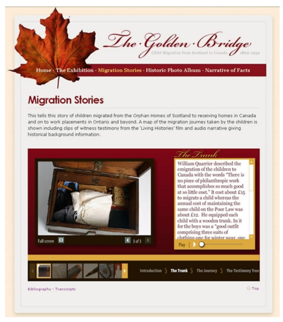
Figure 3: The Trunk

A user-controlled slideshow of images of the replica children's trunk and its contents, has been blended with text and audio describing the images and connecting them with the migration story (figure 3).