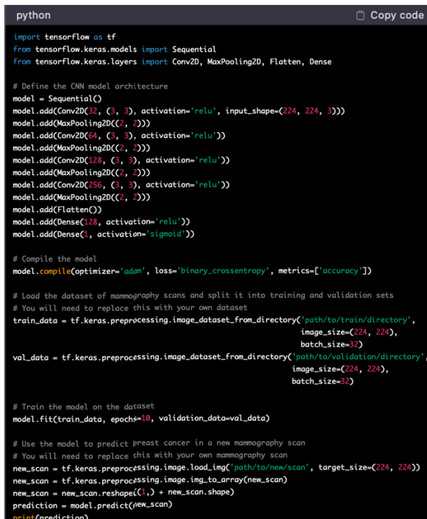
Figure 3. Generated from ChatGPT from the text prompt “write code for an AI to analyze mammography scans.”

We then asked ChatGPT to code an AI to classify mammography scans (Figure 3).