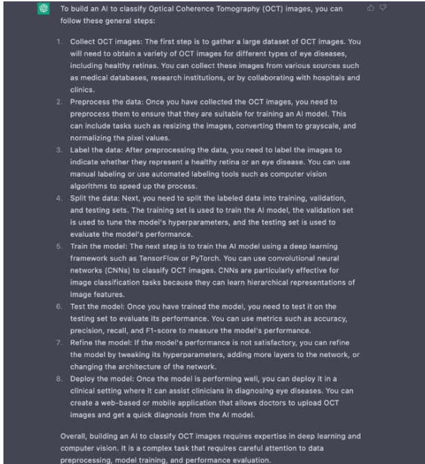
Figure 2. Generated from ChatGPT from the text prompt “how can I build an AI to classify OCTs.”

We then asked ChatGPT to code an AI to classify mammography scans (Figure 3).