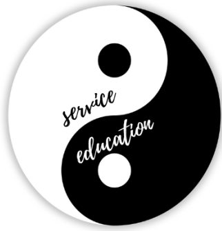
Figure 2. Visual representation of service and education using a Yin-Yang approach

This idea can be applied to the service to education ratio in medical education, where service and education are two forces that are necessary for the development of medical professionals. For example, there is a growing recognition that medical education needs to better prepare trainees for the increasing demands of medical practice across vastly different settings spanning large academic centers to remote or global settings. 3 Our framework highlights that approaches to education must be therefore reshaped to provide the knowledge and tools to address the real-world challenges encountered when providing medical services. At the same time, the experience of clinical service can be better understood as an opportunity to deepen knowledge and skills in a safe and supervised setting, while ensuring an appropriate breadth, depth, and volume of exposure to a variety of patient populations. This is an example of the Yin-Yang approach to medical education in the development of the medical expert role from the CanMEDS framework. We provide specific examples of the Yin-Yang relationship of education and service through the rest of the CanMEDS roles in Table 1.