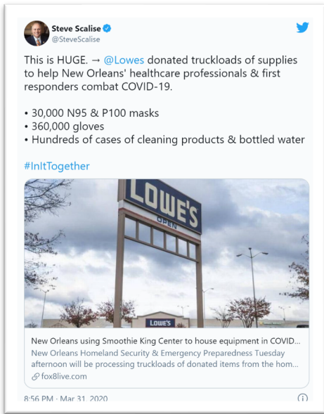
Figure 2 Lowe’s announcing that large shipments of PPE are donated to the HCP. Large corporations such as Lowe’s, Home Depot, and Target donated PPE to the hospitals and first responders.” 31