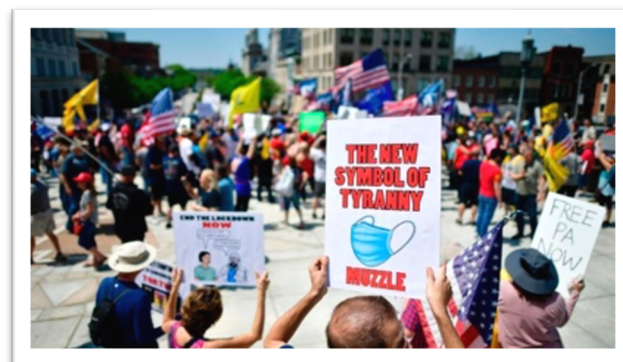
Figure 3.. A demonstrator holds a placard with a face mask stating, “THE NEW SYMBOL OF TYRANNY MUZZLE.” People had gathered outside the Pennsylvania Capitol Building to protest the continued closure of businesses due to the coronavirus pandemic on May 15, 2020 in Harrisburg, Pennsylvania. 110

The discourse of mask as a symbol of rights and freedoms was constructed in opposition to the idea perpetuated with the circulation of the discourse of mask as PPE. The later discourse was deployed in efforts to limit the virus’ spread by appealing to the individual decisions of millions to comply with public health directives to wear masks in public. As bioethicist Nancy Kass, deputy director for public health of Johns Hopkins University’s Berman Institute stated, “masks can be a form of virtue-signaling. By wearing a mask, people show their concern for keeping other people safe.” 42 Habitual mask wearing is constructed as a civic duty in the discourse of face mask, both to protect others and to take responsibility for oneself, especially seen in Eastern Asia cultures, such as China and Japan. An article by the South China Morning Post acknowledged that “wearing face masks is often seen as a collective responsibility to reduce disease transmission and can symbolise solidarity.” 43