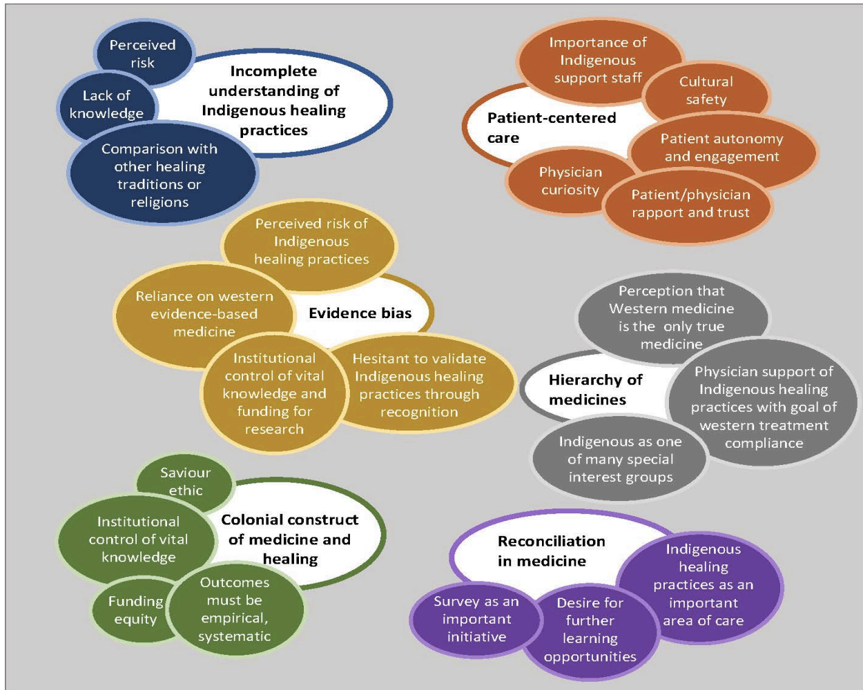
Figure 2. Overarching qualitative themes extracted from the text responses (larger, open bubbles) and their sub-themes (smaller, filled bubbles), with quotes from respondents that illustrate the themes.