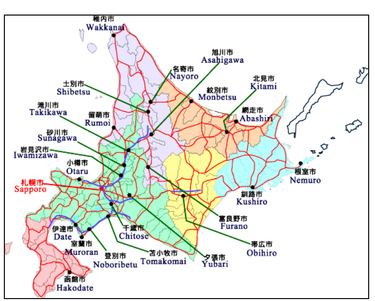
Figure 1 Map of Hokkaido

In Hokkaido, the northern part of Japan, even though the road and traffic conditions are different from other parts of Japan, the same speed limit regulations are applied. Traffic volume is relatively low, especially on the rural national highways. Approximately 90% of the national highways in Hokkaido are two-lane highways and can be classified as rural national highways (Ministry of Land, Infrastructure and Transportation, 2005). Only a few areas in Hokkaido are classified as urban such as Sapporo, Otaru, Hakodate and Asahikawa as shown in Figure 1.