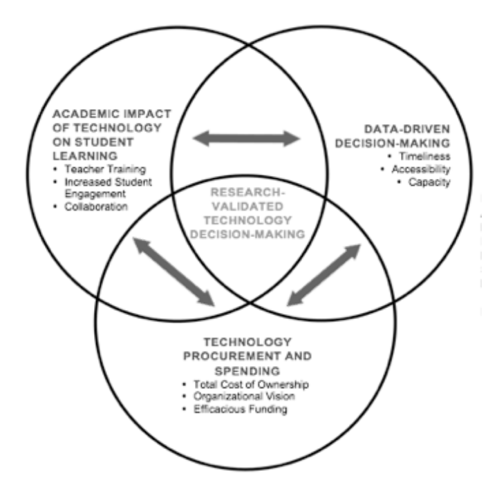
Figure 1. Theoretical Framework of Technology Decision-Making.