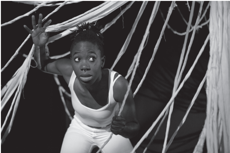
d'bi young anitafrika performing as Benu at the Tarragon theatre in 2011.

young anitafrika skillfully employs the power of sound, rhythm, rhyme, and metre to convey complex ideas and develop the characters she plays within the short space of time that she is on stage. Indeed, her performances are sheer poetry, both in the sense of being sublime and because she uses poetry as a dramatic tool. Peaches, for example, provides a comprehensive portrait of single motherhood in straitened economic circumstances in verse form that takes no more than a couple of minutes of stage time. In some senses, what young anitafrika achieves is not unlike the verse that added resonance to Shakespeare's plays, or the way in which postcolonial dramatists such as Derek Walcott and Wole Soyinka mingle prose with verse forms that owe as much, if not more, to the storytelling, song, and rituals of their native oral traditions than to the history of theatre practice in the West. young anitafrika's work is distinguished by the explicit connection she draws between her theatre aesthetic and the political and poetical formulations that underlie dub poetry.