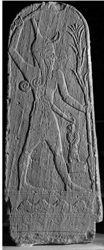
Figure 1. (L) Baal. Image number: AN32519001.