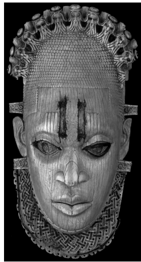
Figure 4. (R) Benin Mask. Image number: AOA 1910.5-13.1