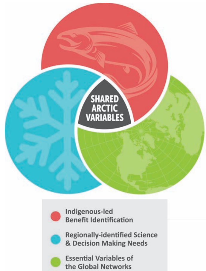
FIG. 1. Following rigorous assessment of societal benefit, Shared Arctic Variables (SAV), which characterize a fundamental aspect of the Arctic System, are identified at the intersection of benefit realization from at least two broad constituencies of use. An ideal SAV would realize community-identified benefits in Indigenous communities (light red), support fundamental understanding of Arctic systems and regional decision-making needs (blue), and inform science and decision-making needs at the global scale and integrate with operational global networks (green). Observing and data system implementation strategies for SAVs would then find support from these broad constituencies as well. For example, community-embedded observing strategies that are organized within the context of Indigenous data sovereignty would be best suited to support community identified requirements within an SAV.

In keeping with the ROADS principle of complementing current efforts in a non-duplicative approach, relevant global linkages should be identified from existing catalogs of essential variables associated with global networks (e.g., essential ocean variables, essential climate variables, essential biodiversity variables), regional programs (e.g., AMAP and CBMP), and with reference to gaps analyses like the European Space Agency’s Polaris assessment (Polar View Earth Observation Limited, 2016). A global variable should only be directly adopted by ROADS as a SAV if it is found to be critical across sectors, and the global definition