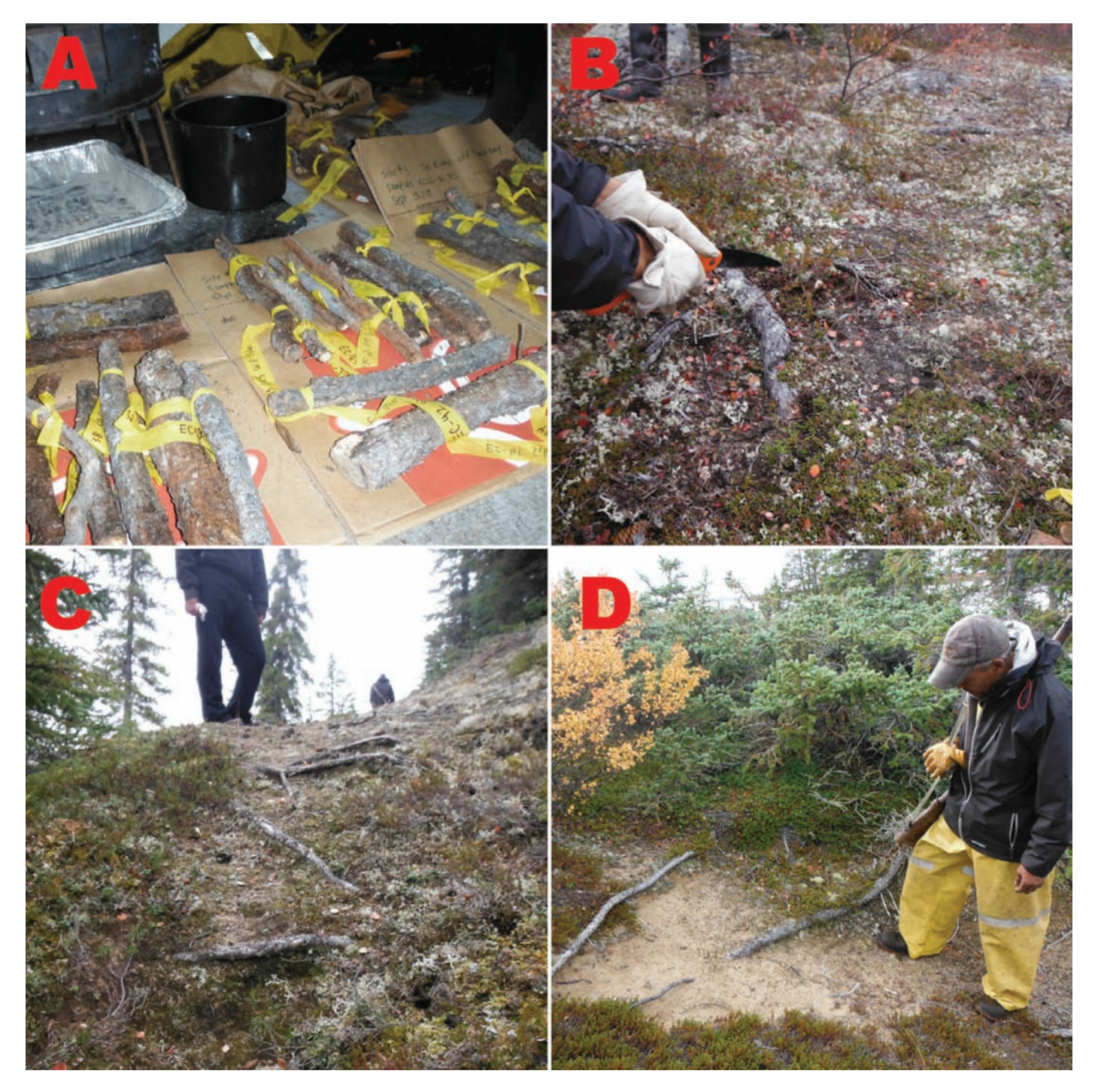
FIG. 3. Images of caribou trails and sample collection by community research assistants. (A) Black spruce root samples drying in the field prior to transport; (B) Sample extraction using a hand saw; (C) Older caribou trail with exposed roots evidenced by vegetation growth including some lichen, which have a long growth period; (D) Pete Enzoe assesses caribou trail conditions while searching for suitable sample locations.

Elders also differentiated between trails with exposed soil with worn-down roots and ones that had been grown over with vegetation. "I know that a caribou trail used a lot will wear the roots down; they even had trails in the sand ridges, now nothing" (Madeline Drybones, Ptarmigan River, 2012). Many Elders also pointed out the clear difference between the main caribou trail and secondary trails. "There's all kinds of caribou trails but there's one