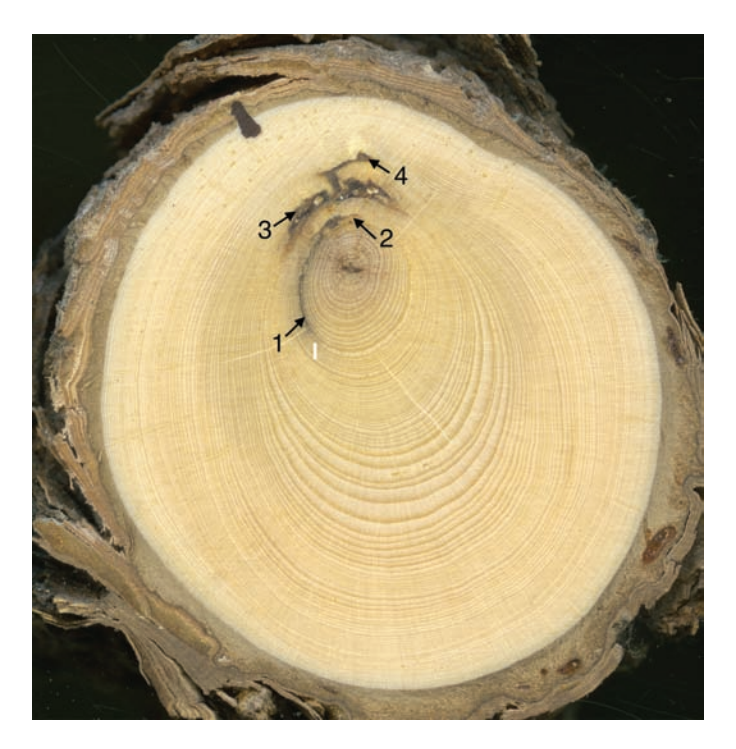
FIG. 4. Example of cross-section with caribou trample scars. (1) 1912, (2) 1926, (3) 1945, and (4) 1970.

that means it's not being used much. All year round there is caribou around ?edacho Kué. It used to be like that. And now the mines are sitting on the caribou trails. (Madeline Drybones, K'ásba Deze, 2012)