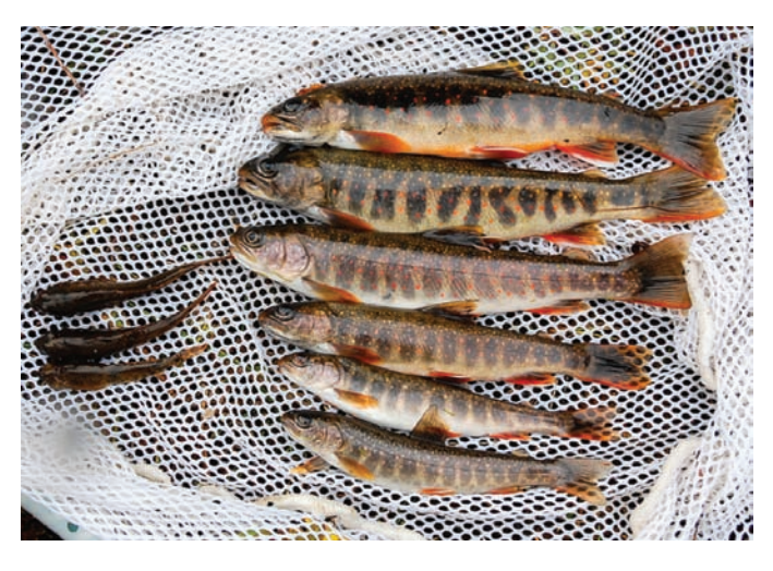
FIG. 2. A representative voucher sample of total catch from site ARRH08. Slimy sculpin (n = 3) are shown on the left and Dolly Varden (n = 6) are shown on the right.

were recorded before each fish was released. A random subset of char were lethally sampled, frozen whole, and shipped to the Freshwater Institute in Winnipeg, Manitoba, to confirm field-based identifications and collect additional biological data (Table 1; Fig. 2). Ages were determined using whole otoliths, which is a reliable method for ageing northern form Dolly Varden less than age nine (Gallagher et al., 2016).