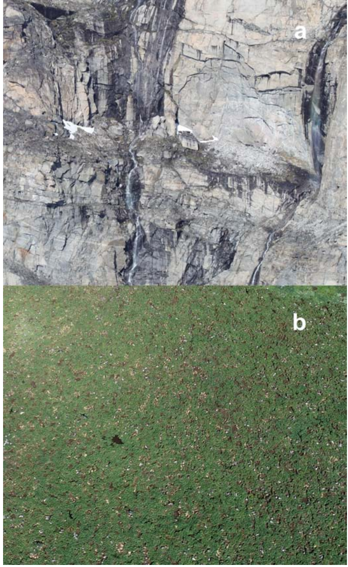
FIG. 3. Representative portions of photos from Northern Fulmar census work at Qaqulluit National Wildlife Area: a) cliffs, and b) top of the rock towers.

counts) and collectively represented the complete breeding area for each site. Resultant stitched images ranged from 600 \times 600 dpi to 900 \times 900 dpi, with total sizes 60-100megapixels each. With each large image, we zoomed into parts of the file (typically 200-300 \times magnification), placed a coloured dot over each identified fulmar, counted the entire image, and then tallied up total birds observed at each site. Repeatability of counts from portions of colonies varied, largely due to some differences in the quality of the images, but was generally high. For example, at Scott Inlet, two separate counts of the same five images (total count mean = 9050 fulmars) by the same observer had a difference of 0.2% (16 birds). For interobserver comparisons from Buchan Gulf and Qaqulluit, four subsamples from images conducted among three observers