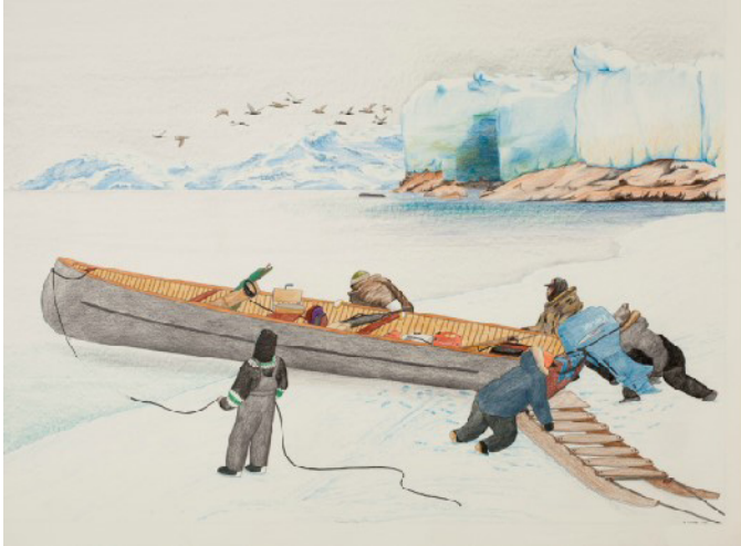
FIG. 2. Tim Pitsiulak: “Launching canoe at flow edge,” 2012. Shown with permission of artist, co-ops, and galleries.

emphasizes both knowledge of how sea ice is changing and at the same time embraces change and uncertainty as a part of life: