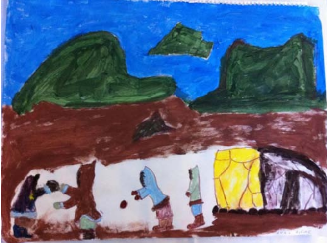
FIG. 5. Elisapee Ishulutaq: "It's a wonderful day, a beautiful day," 2013. Shown with permission of the artist.

The igloo is melting and we see a tree we don't see here in the Arctic. I was told you won't see it here, but we see more and more new and larger plants... [The drawing is] about the way the climate is changing—it's warming up ... The person there is glad to see the tree. The person is happy to see the tree growing where it is not even supposed to grow ... I like anything that grows on the land, anything that renews itself, like springtime ... The igloo is long gone history and [the Inuk] is happy that things are growing; it is a transition theme.