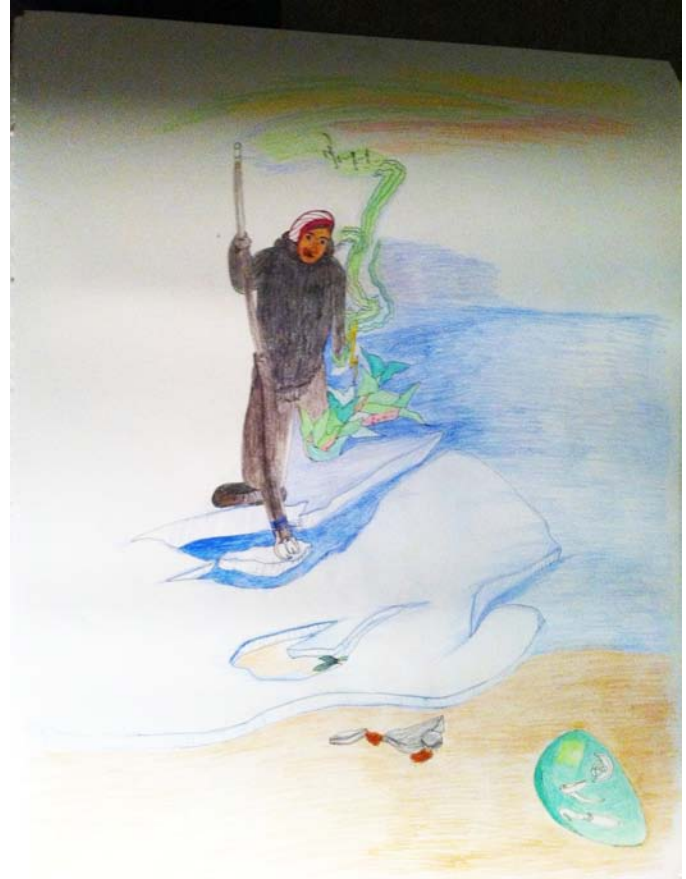
FIG. 8. Shuvina Ashoona: “Untitled,” 2013. Pencil crayon on large format paper. Shown with artist’s permission.

Another belief held by Ashoona and embedded into her drawing is intergenerational connection. Ashoona portrayed that “our grandchildren would be dancing up there [as northern lights]” (Fig. 8). The drawing emphasizes belief in the existence of spiritual connection via entities like northern lights. “Our grandchildren are dancing and