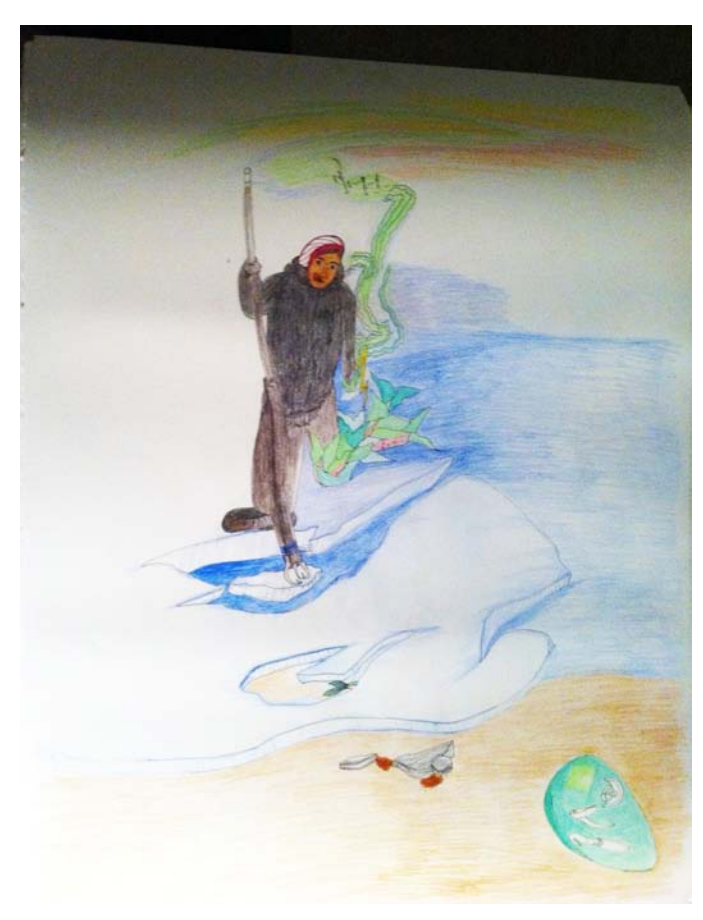
FIG. 8. Shuvinai Ashoona: "Untitled," 2013. Pencil crayon on large format paper. Shown with artist's permission.

Another belief held by Ashoona and embedded into her drawing is intergenerational connection. Ashoona portrayed that "our grandchildren would be dancing up there [as northern lights]" (Fig. 8). The drawing emphasizes belief in the existence of spiritual connection via entities like northern lights. "Our grandchildren are dancing and