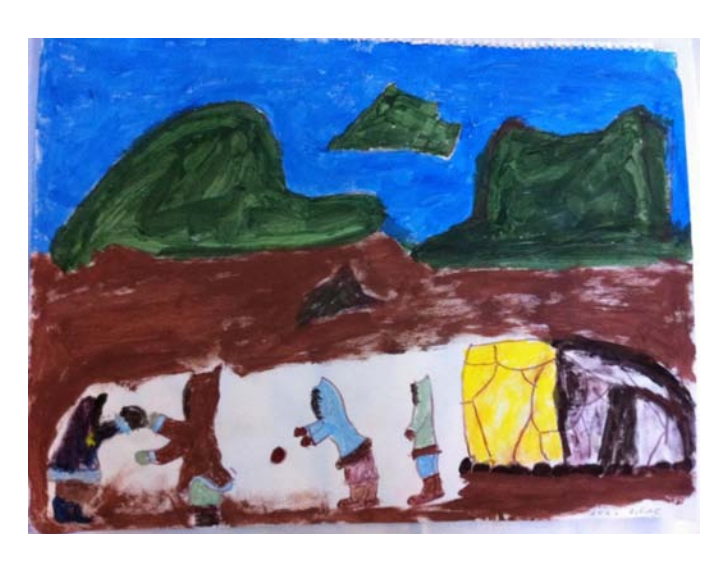
FIG. 5. Elisapee Ishulutaq: "It's a wonderful day, a beautiful day," 2013. Shown with permission of the artist.

The igloo is melting and we see a tree we don't see here in the Arctic. I was told you won't see it here, but we see more and more new and larger plants... [The drawing is] about the way the climate is changing—it's warming up ... The person there is glad to see the tree. The person is happy to see the tree growing where it is not even supposed to grow ... I like anything that grows on the land, anything that renews itself, like springtime ... The igloo is long gone history and [the Inuk] is happy that things are growing; it is a transition theme.