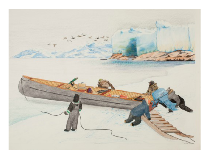
FIG. 2. Tim Pitsiulak: "Launching canoe at flow edge," 2012. Shown with permission of artist, co-ops, and galleries.

emphasizes both knowledge of how sea ice is changing and at the same time embraces change and uncertainty as a part of life: