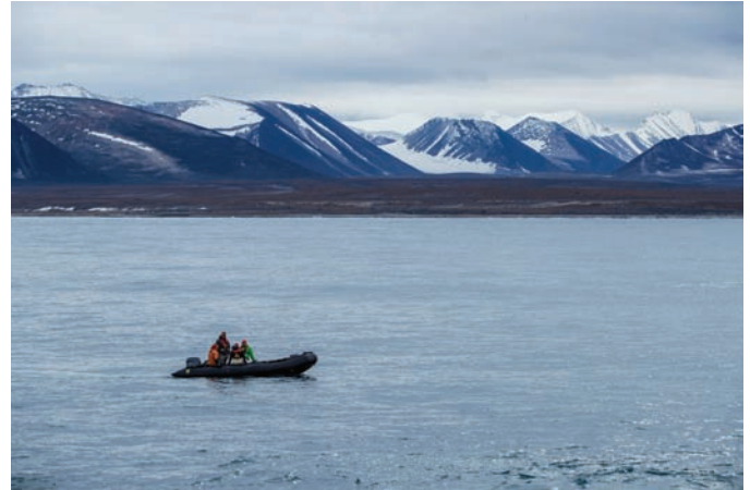
Fig. 1. Searching for the Nova Zembla, August 2018.