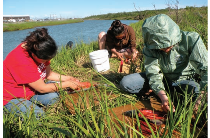
FIG. 3. St. Lawrence Island youth berry-picking near Nome, Alaska (left). Women cutting fish in Nome, Alaska (right).