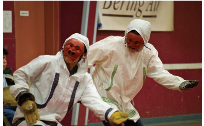
FIG. 4. King Island Dancers performing a “Noisy Twins Dance.”

Another community member described the loss of the language in a traditional musical genre: