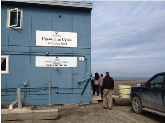
FIG. 1. Visiting an Iñupiaq language nest on the shores of the Arctic Ocean, Utqiagvik, Alaska.

Māori language and culture. Following the success of the Māori programs, the language nest initiative has now spread to many other Indigenous communities, starting from neighboring Polynesian languages (e.g., Hawaiian), then to the continental United States (e.g., Cherokee, Mohawk, Lakota, Choctaw), and now extending around the world. For example, on a recent visit to Utqiagvik, Alaska, we had the privilege of learning about an Iñupiaq language nest that serves local children on the shores of the Arctic Ocean (Fig. 1), which highlights the far-reaching effects of the Māori initiative.