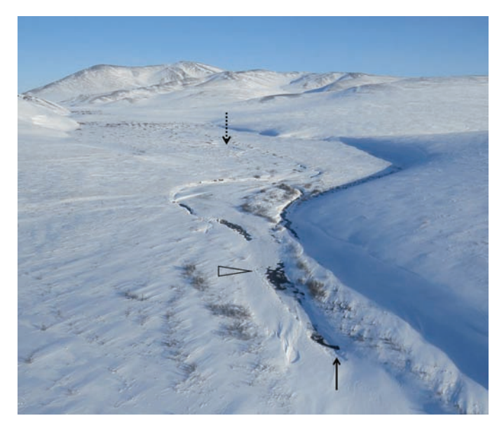
FIG. 2. A perennial groundwater spring in Fish Creek, Yukon, in Ivvavik National Park on 8 March 2018 taken from a helicopter approximately 50 m above the ground. Vertical arrows indicate the upper (solid line) and lower (dashed line) extent of open water sections (stretch of river between arrows was \sim 730 m in length). The width of open water at the open triangle is 4.25 m. Image is facing northeast with Mount Conybeare (highest peak) in the background.

could increase our understanding of how diet influences energetic thresholds and affects the decision to overwinter or migrate to more southern overwintering areas. Future surveys to document additional locations where American Dipper overwinter in river systems draining the North Slope region should use the maps provided by Craig and McCart (1974) and Kane et al. (2013) to assist with site selection. Many of the specific locations mentioned by Craig and McCart (1974) are also inhabited by Dolly Varden.