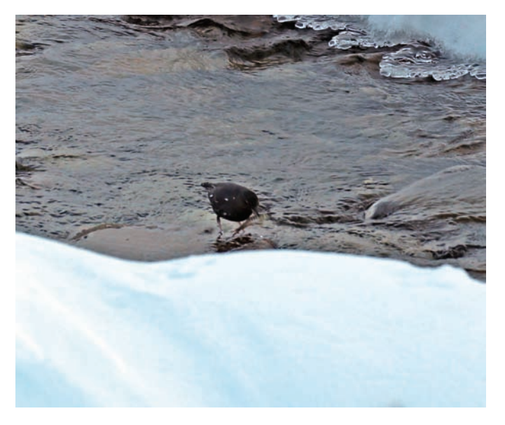
FIG. 3. American Dipper in Fish Creek, Yukon, in Ivvavik National Park with a juvenile Dolly Varden in its beak (8 March 2018).

In addition to documenting the northernmost observation of American Dipper in Canada, we characterized openwater habitat of a previously undescribed river system in Ivvavik National Park and provided novel photographic evidence demonstrating that American Dippers prey on juvenile Dolly Varden during winter. Documenting