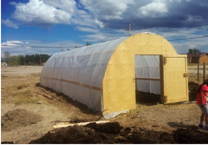
FIG. 2. Photograph of the hoop house at the end of construction.

classes and introducing the children to the idea of gardening and greenhouses. At the outset of the project, community leadership made it clear that they wished to engage the school in the hoop house project as much as possible. Under the direction of the principal, the research team worked with students in the classroom not only to educate, but also to foster a sense of ownership and excitement about the hoop house project in the schoolchildren. The children were given the opportunity to provide input on what would be planted in the garden during the school workshops, and they were invited after school to help with simple gardening tasks such as weeding and raking. The children were also encouraged to continue to visit and help with the hoop house throughout the first growing season. It was believed that if local youth were interested and involved in the garden from the outset, they would respect and enjoy the hoop house throughout the growing season. During initial conversations about the project, community leaders and the local coordinator made it clear that youth should be actively involved in all stages of the project because of their concern that the hoop house structure would be vandalized.