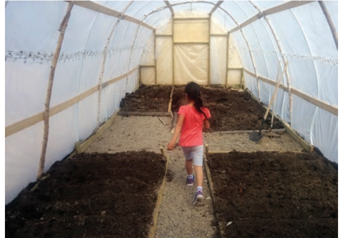
FIG. 3. Raised garden beds in the interior of the hoop house, along with a student from the Reverend Eleazar Winter Memorial School.