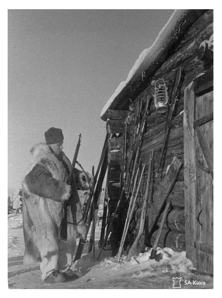
FIG. 4. A guard wearing a reindeer skin taking his gun and skis from the wall of a cabin to start his shift during the Winter War in 1940.

of state funds and private donations, but the herders had to adapt to the Finnish HD system (Länsman, 2000; Lehtola, 2015b). In 1952, what was known as the Skolt Act came into force, securing the living conditions of about 600 Skolt Sámi (Lähteenmäki, 2017).