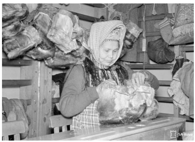
FIG. 5. Skolt Sámi evacuee (above) and an evacuated Skolt Sámi woman making slippers from reindeer skin at a school (below) during the Winter War in 1940.

such as blood and organs, and, for example, production of reindeer sausage began (Anon., 1940a).