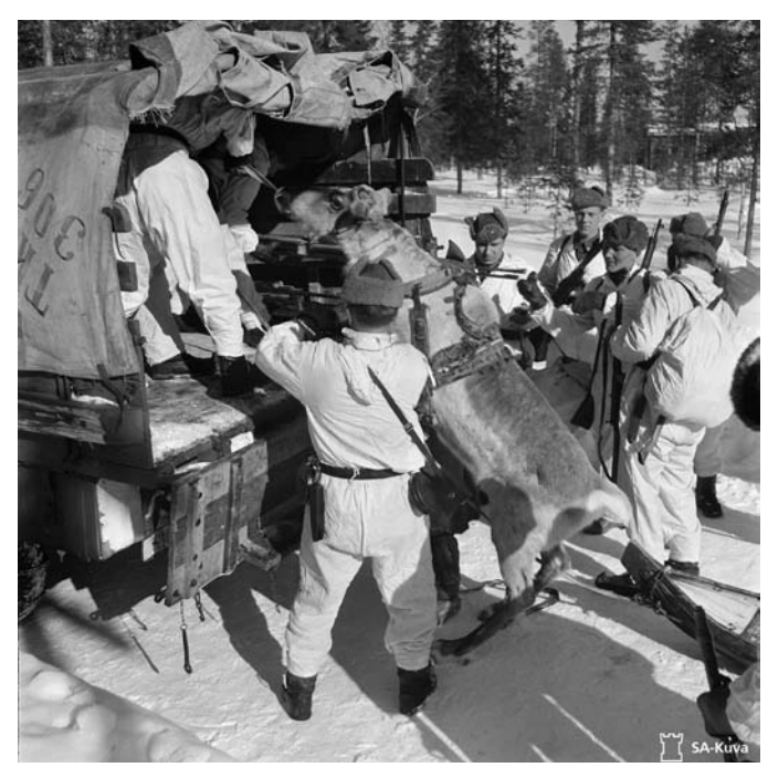
FIG. 3. Light troops leaving to prevent Russian commando attacks. The reindeer is being lifted up into the lorry. It will be used to pull ammunition and other supplies in a sledge. Savukoski, northeastern Finland during the Lapland War in 1944.

The role of the Finnish horse during WWII has been recognized (Ojala, 2007), but less is known about the role of reindeer. According to Alaruikka (1939), reindeer played an important role in winter maintenance operations in northern Finland. Use of draught reindeer was advantageous in the wilderness and on the fells. There was no need to build roads through the forests (Anon., 1964) or to bypass difficult terrain. Reindeer were used for communication, patrolling, and as a means of transport. In widely dispersed units, vehicles were replaced with reindeer. Far-ranging scouting and destruction patrols operating behind enemy lines were supplied with reindeer, which carried equipment and food (Fig. 3). The most tired men could rest in the sledge. Silent maintenance columns using reindeer were harder to detect than horses even by air reconnaissance. Herders drove and herded the reindeer and no special forage had to be provided (Alaruikka, 1939; Anon., 1964). For example, at the front in Lutto there were between 500 and 750 reindeer pulling sledges or carrying supplies. "Even in deep snow one strong reindeer pulling a