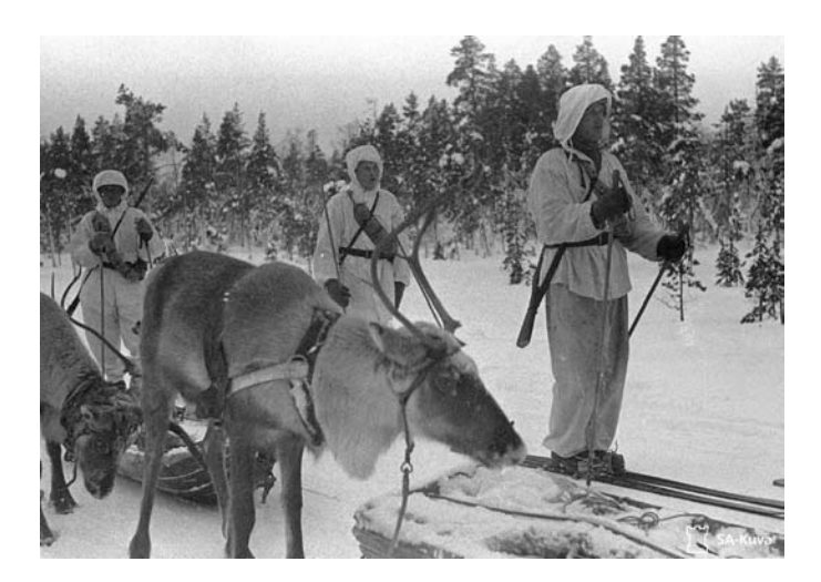
FIG. 2. Patrol consisting of reindeer and soldiers wearing snow camouflage clothing in Jäniskoski, Petsamo, northeastern Finland during the Winter War in 1940.

In addition to meat obtained through slaughter, meat was sold to citizens with ration coupons at the roundup sites. The availability of meat, among other foods, was regulated because of the severe food shortage (Järventaus et al., 1984). Herds grazing close to the border provided a significant food reserve for the army. The herds to be slaughtered could be brought to the food delivery site without using any extra energy for their transport. Reindeer meat was suitable food for the detachments lodging in the wilderness, and even the blood of the slaughtered animals could be used (Alaruikka, 1939, 1967; Anon., 1964).