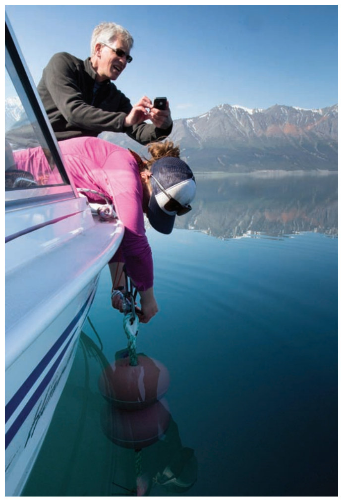
FIG. 6. Checking the moorings and downloading data during the open-water season.

surface of the water so as to eliminate disturbance by ice and minimize drag or pull from wind and waves during the open-water season. We find the moorings again by GPS locations and using SubSea Sonic Accoustic Releases