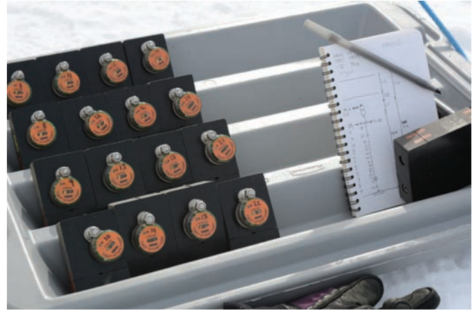
FIG. 5. HOBO Tidbit temperature dataloggers ready to be mounted on the mooring line.

Four moorings (Brooks Arm [8 m], Talbot Arm [35 m], Deep [72 m], and Slims [40 m]) (for locations see Fig. 2) were designed and constructed with the support of the Dän Keyi Renewable Resources Council Accumulated Surplus Fund and the Department of Fisheries and Oceans (Mike Dempsey and Eddy Carmack). The moorings are equipped with HOBO Tidbit Temperature loggers (located every 2-5 m throughout the water column, logging every hour), and a HOBO U24 Conductivity logger (located near the surface, logging every 2 hours) (Figs. 4-6). The tops of the moorings are located approximately 2 m below the