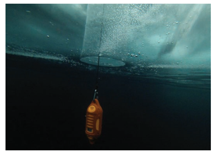
FIG. 3. Castaway CTD instrument being deployed through the ice at Lhù'ààn Mān.

This research also coincided with a drastic reduction in flow of the Ä'äy Chù (Slims River; Lhu'aan Mān's primary inflow) in May 2016 (Shugar et al. 2017). The Kaskawulsh Glacier meltwater had fed both the Ä'äy Chù and the Kaskawulsh River until recession and terminus changes resulting from climate change reached a critical point in 2016, causing the glacier's meltwater to flow entirely into the Kaskwulsh River. The Ä'äy Chù now comprises only tributary waters. The significant decrease of water flowing into Lhù'ààn Mān from the Ä'äy Chù valley in turn produced the lowest lake water levels recorded since