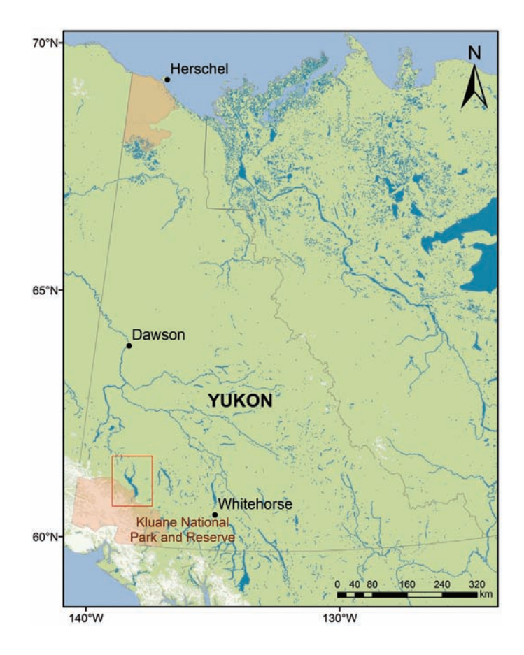
FIG. 1. Location of Lhù'ààn Mān (Kluane Lake), Yukon Territory, Canada.

Yukon is home to many large lakes, the largest being Lhù'ààn Mān (Kluane Lake), located in the southwest of the territory at the foot of the St Elias Mountains (Fig. 1). Lhù'ààn Mān lies within the traditional territories of the Kluane First Nation and White River First Nation and borders those of the Champagne and Aishihik First Nations. The lake is important to local communities for fishing, cultural activities, and travel. Lhù'ààn Mān also provides an excellent case study for assessing the potential impacts of climate change on the properties of large northern lake systems. The southwest Yukon has experienced significant warming over the past few decades, which has resulted in changes to the surrounding vegetation (Danby et al., 2011; Myers-Smith and Hik, 2017) and cryosphere (including snowcover, permafrost degradation and glacier recession