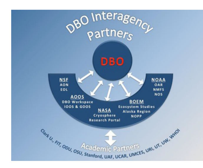
FIG 2. Government agency and academic partners collaborating in support of the DBO, via the U.S. Interagency Arctic Research Policy Committee (IARPC). See Appendix 1: Table S1 for an abbreviated list of contributions and Table S2 for a list of acronyms.

a 5-year plan focused on seven research themes. The DBO Collaboration Team (CT) was formed under the first theme, Sea Ice and Marine Ecosystems, and met via teleconference through 2016 to guide the DBO from a pilot phase to the development of a decadal-scale implementation phase (http://www.iarpccollaborations.org/teams/Distributed-Biological-Observatory). In this paper, we summarize key partnerships, products, and science contributions achieved in support of developing the DBO as a regional ocean observatory for the Pacific Arctic. We also outline future activities to both enhance the DBO and to connect it to a pan-Arctic network of environmental observatories.