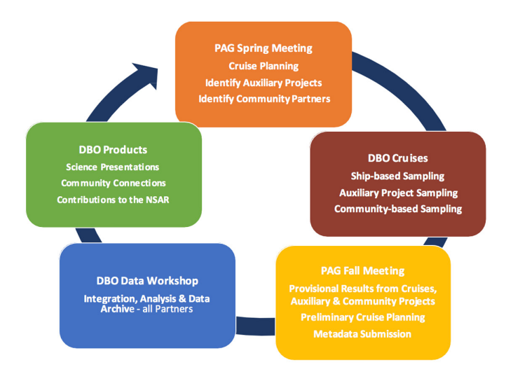
FIG 3. Five-step annual cycle for implementation of the DBO, from cruise planning to products.