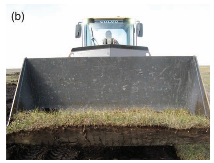
FIG. 3. (a) The mechanical sod cutter (nuna ulu) making vertical cuts at the harvest site, and (b) the loader used to remove large blocks of sod.