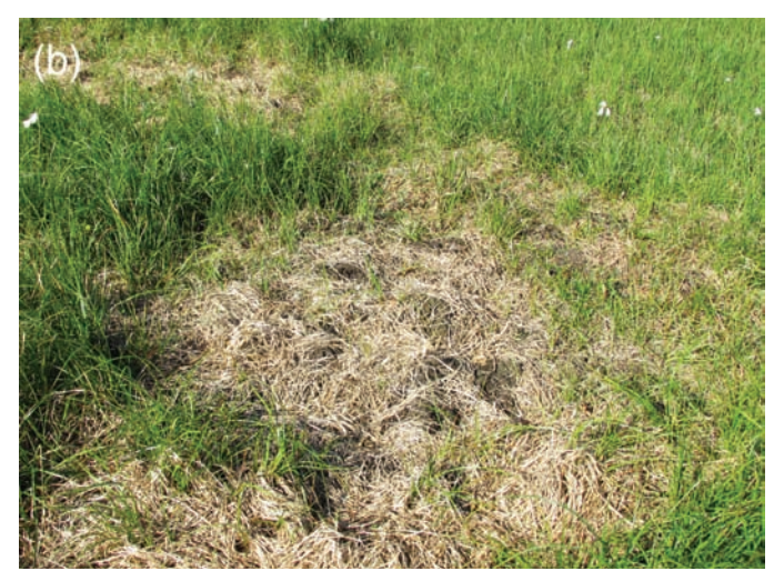
FIG. 4. (a) The sodded area at Site D surrounded by undisturbed tundra, and (b) a patch of dead vegetation attributed to microtine activity after tundra sodding at Site B.