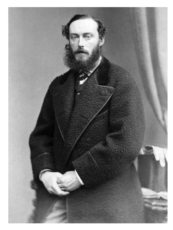
FIG. 2. Sir James Lamont of Knockdow.

allowed Lamont to purchase Ginevra , which carried him throughout the Mediterranean, across the Atlantic to Labrador, and then into Arctic waters.