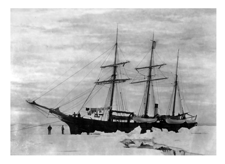
FIG. 4. The steam-assisted schooner Diana in the ice near Lågøya off the north coast of Svalbard during Benjamin Leigh Smith's expedition of 1873.

Carried aboard Diana on Lamont's cruises of 1869–71 were hydrographical instruments belonging to the British Navy, with which temperature and salinity measurements were recorded (Lamont, 1876:6). Lamont explained that "My excellent friend, the late Sir Roderick Murchison, then President of the Royal Geographical Society, took great interest in the proceedings [for the later cruises of