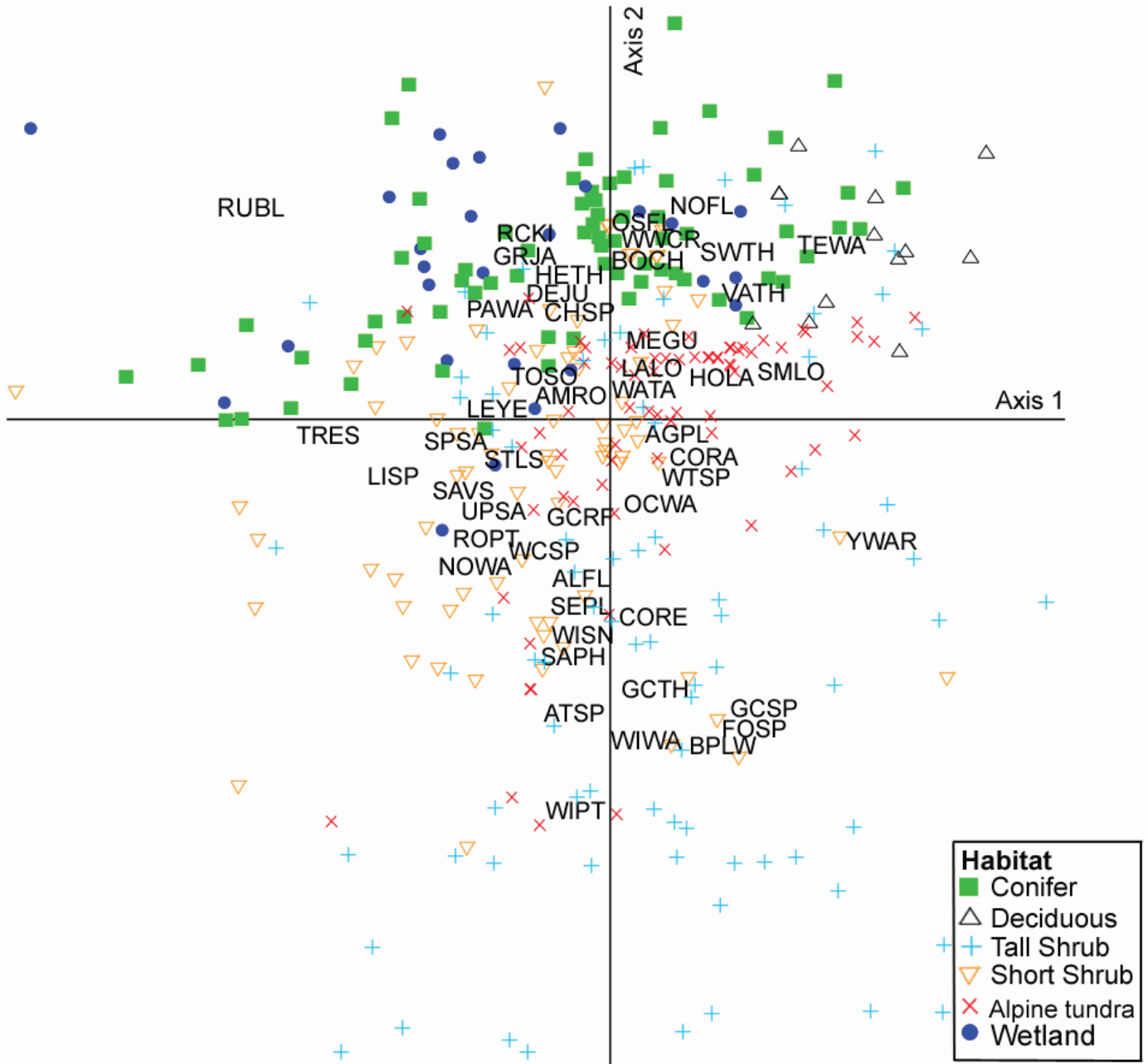
FIG. 2. Non-metric multidimensional scaling (NMS) ordination of bird communities in six habitat types surveyed in the Mackenzie Mountains, Northwest Territories, 2009 and 2010. Common and scientific names for species codes are listed in Table 2.

to wetland (center) to deciduous (right) and Axis 2 represented a gradient from high (bottom) to low (top) shrub density. There is considerable overlap in treed habitats (conifer, deciduous, and wetland) and greater divergence between treed, shrub, and alpine habitats. Alpine habitats contained the most unique bird community, which overlapped the least with other habitat types. Species codes used in the NMS ordination are listed in Table 2.