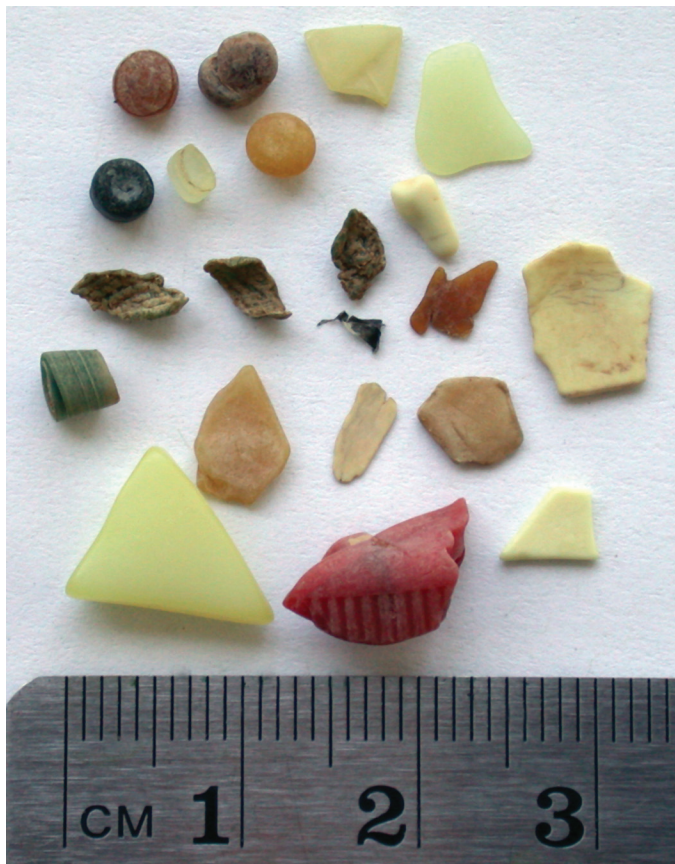
FIG. 1. Ingested plastic debris found inside a Northern Fulmar in northern Canada.

Tracking emerging diseases has been part of the northern marine bird research program in the last decade (Descamps et al., 2012; Harms, 2012). One of the largest efforts in emerging disease research in marine birds has been the study of avian cholera among waterfowl (ducks and geese). Avian cholera is a bacterial disease with outbreaks that can cause significant mortality, particularly at stopover sites and breeding colonies where waterfowl species congregate (Samuel et al., 2007). Although avian cholera outbreaks in domestic birds have occurred in the temperate regions of the United States and Canada since the 1880s, the first report of avian cholera in wild waterfowl occurred in 1943–44 in Texas (Samuel et al., 2007). Since that time, avian cholera has been detected in many other regions, including Hudson Bay and northern Quebec, where it was found in breeding Common Eider ducks in 2005 (Buttler et al., 2011; Harms, 2012). Since the detection of avian cholera in the eastern Canadian Arctic, surveys of Common Eider colonies have been conducted in collaboration with local communities to discover how widespread the disease is in the region and what the impacts may be on eider duck colonies (Fig. 2; S. Iverson pers. comm. 2014). This effort has included performing avian cholera tests on all the birds handled at East Bay and collected by hunters for my PhD research in an effort to identify potential pathways and reservoirs of the disease among wild birds.