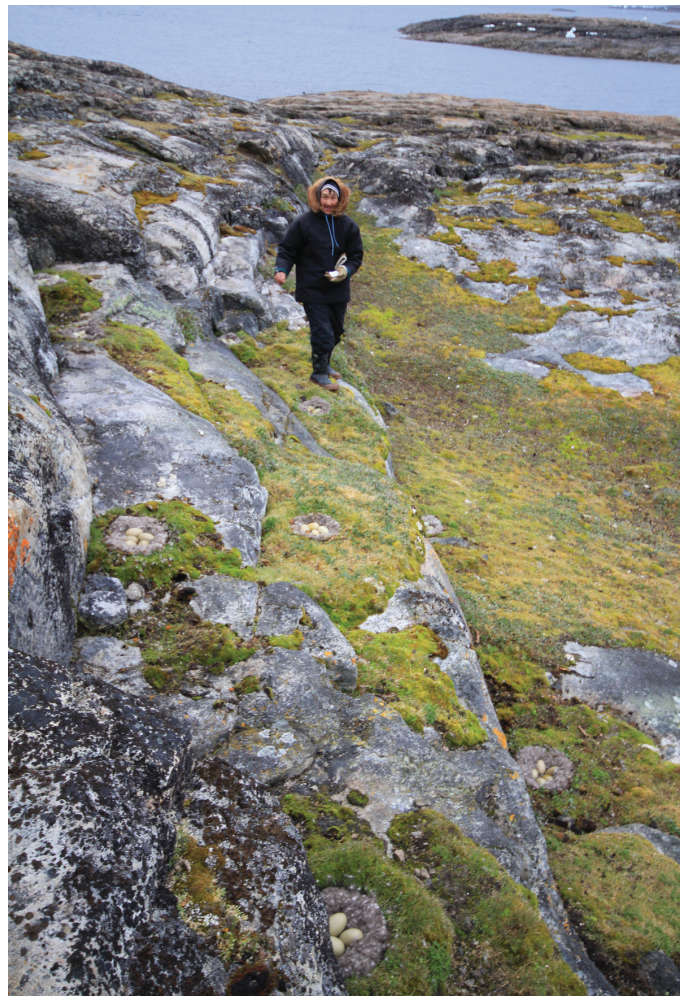
FIG. 2. The northern marine bird research team works with a hunter in Cape Dorset, Nunavut, to survey local eider colonies.

Tracking emerging diseases has been part of the northern marine bird research program in the last decade (Descamps et al., 2012; Harms, 2012). One of the largest efforts in emerging disease research in marine birds has been the study of avian cholera among waterfowl (ducks and geese). Avian cholera is a bacterial disease with outbreaks that can cause significant mortality, particularly at stopover sites and breeding colonies where waterfowl species congregate (Samuel et al., 2007). Although avian cholera outbreaks in domestic birds have occurred in the temperate regions of the United States and Canada since the 1880s, the first report of avian cholera in wild waterfowl occurred in 1943–44 in Texas (Samuel et al., 2007). Since that time, avian cholera has been detected in many other regions, including Hudson Bay and northern Quebec, where it was found in breeding Common Eider ducks in 2005 (Buttler et al., 2011; Harms, 2012). Since the detection of avian cholera in the eastern Canadian Arctic, surveys of Common Eider colonies have been conducted in collaboration with local communities to discover how widespread the disease is in the region and what the impacts may be on eider duck colonies (Fig. 2; S. Iverson pers. comm. 2014). This effort has included performing avian cholera tests on all the birds handled at East Bay and collected by hunters for my PhD research in an effort to identify potential pathways and reservoirs of the disease among wild birds.