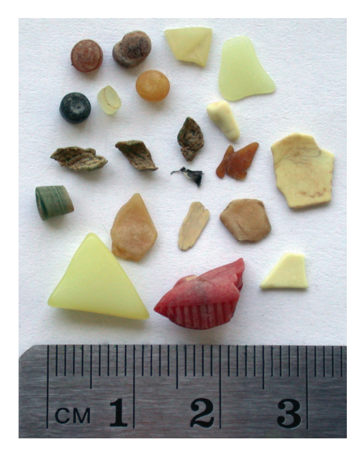
FIG. 1. Ingested plastic debris found inside a Northern Fulmar in northern Canada.

Tracking emerging diseases has been part of the northern marine bird research program in the last decade (Descamps et al., 2012; Harms, 2012). One of the largest efforts in emerging disease research in marine birds has been the study of avian cholera among waterfowl (ducks and geese). Avian cholera is a bacterial disease with outbreaks that can cause significant mortality, particularly at stopover sites and breeding colonies where waterfowl species congregate (Samuel et al., 2007). Although avian cholera outbreaks in domestic birds have occurred in the temperate regions of the United States and Canada since the 1880s. the first report of avian cholera in wild waterfowl occurred in 1943-44 in Texas (Samuel et al., 2007). Since that time, avian cholera has been detected in many other regions, including Hudson Bay and northern Quebec, where it was found in breeding Common Eider ducks in 2005 (Buttler et al., 2011; Harms, 2012). Since the detection of avian cholera in the eastern Canadian Arctic, surveys of Common Eider colonies have been conducted in collaboration with local communities to discover how widespread the disease is in the region and what the impacts may be on eider duck colonies (Fig. 2; S. Iverson pers. comm. 2014). This effort has included performing avian cholera tests on all the birds handled at East Bay and collected by hunters for my PhD research in an effort to identify potential pathways and reservoirs of the disease among wild birds.