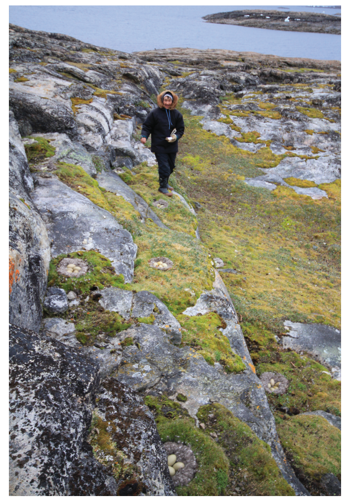
FIG. 2. The northern marine bird research team works with a hunter in Cape Dorset, Nunavut, to survey local eider colonies.

Tracking emerging diseases has been part of the northern marine bird research program in the last decade (Descamps et al., 2012; Harms, 2012). One of the largest efforts in emerging disease research in marine birds has been the study of avian cholera among waterfowl (ducks and geese). Avian cholera is a bacterial disease with outbreaks that can cause significant mortality, particularly at stopover sites and breeding colonies where waterfowl species congregate (Samuel et al., 2007). Although avian cholera outbreaks in domestic birds have occurred in the temperate regions of the United States and Canada since the 1880s. the first report of avian cholera in wild waterfowl occurred in 1943-44 in Texas (Samuel et al., 2007). Since that time, avian cholera has been detected in many other regions, including Hudson Bay and northern Quebec, where it was found in breeding Common Eider ducks in 2005 (Buttler et al., 2011; Harms, 2012). Since the detection of avian cholera in the eastern Canadian Arctic, surveys of Common Eider colonies have been conducted in collaboration with local communities to discover how widespread the disease is in the region and what the impacts may be on eider duck colonies (Fig. 2; S. Iverson pers. comm. 2014). This effort has included performing avian cholera tests on all the birds handled at East Bay and collected by hunters for my PhD research in an effort to identify potential pathways and reservoirs of the disease among wild birds.