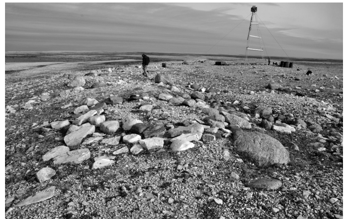
FIG. 4. August 2011 photograph of stone feature at site NILf-7, Cape Felix, possibly the cairn discovered by Hobson in May 1859.

From the perspective of ongoing archaeological research, the report provides additional details about previously undisturbed Franklin sites created both before and after the abandonment of the ships. The availability of descriptions of the sites in situ can provide important baseline information both for contemporary analyses and interpretations and for understanding the processes of site transformation over time. Examples include the tent camp at Cape Felix, which has not been the subject of a detailed archaeological investigation, and of which very little now remains intact. Hobson's report explains that his examination of the cairn involved dismantling it, carrying the rocks away from the feature, digging a five-foot wide circular trench around it at a distance of 10 feet from its centre, and digging up the ground beneath the cairn. We also learn that approximately four weeks later, on May 30th, he rebuilt the cairn. Nothing of it remains standing today (Fig. 4). Similarly, Hobson's description of the removal of the contents from the boat he found in Erebus Bay contains details that contribute to our understanding of the condition of the site and of the surrounding area as found by later search expeditions. Hobson's use of a pickaxe to remove the large quantity of frozen