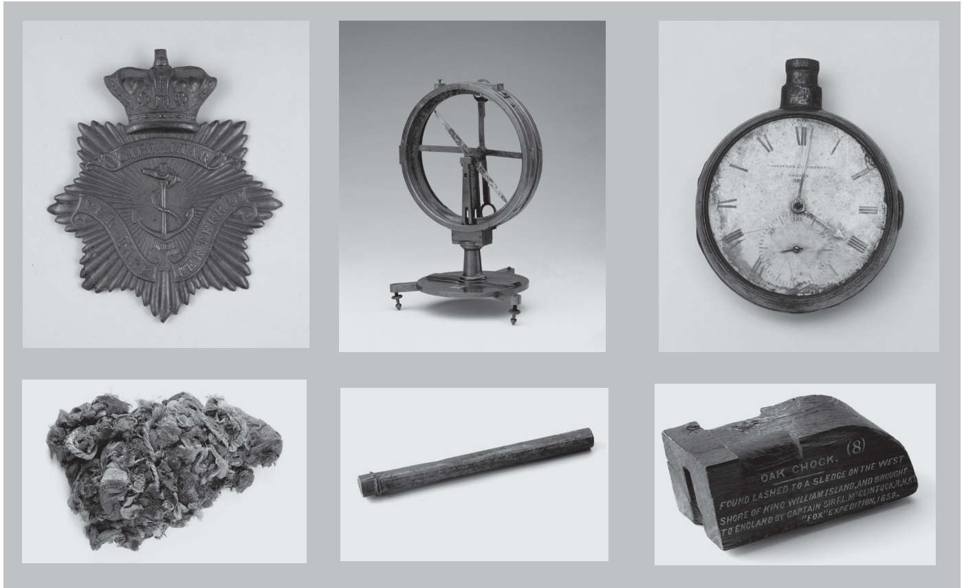
FIG. 3. Examples of Franklin expedition relics recovered by William R. Hobson on King William Island. Left – from Cape Felix: Royal Marine shako plate (top); naval ensign (bottom). Centre – from Victory Point: dip circle (top); record tin (bottom). Right – from Erebus Bay: pocket chronometer (top); oak chock (bottom).

of blizzard conditions, was discovered on the return trip only because Hobson recognized, at what proved to be an opportune time, that they were sledging too far from shore and sent two members of his party to walk the coastline.