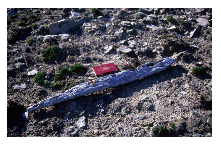
FIG. 7. ObPd-10: Sled runner dated to 630 \pm 50 BP.