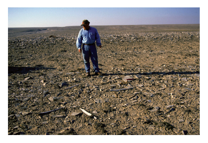
FIG. 2. ObPk-5: Scatter of cross slats and sled shoes. Wood cross slat dated at 620 \pm 50 BP.

quite rapidly (Dyke and Savelle, 2000), we feel that the dates will be only decades, rather than centuries, too old. In that regard, the dates are no less accurate than charcoal dates from boreal regions; indeed, they are better controlled for within-tree provenance. Stefansson (1929:171) inferred from numerous pieces of adzed driftwood along a beach on the mainland shore in Copper Inuit territory that they "... had been testing the pieces of wood to see if they were sound enough to become the materials for sledges or other things they had wished to fashion. Those pieces which had but one or two adze marks had been found unsound. In a few places, piles of chips showed that a sound piece had been roughed down there to make it lighter to carry away."