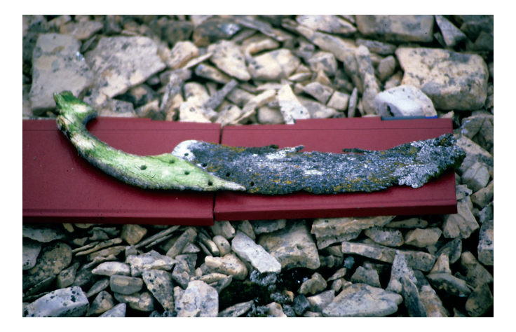
FIG. 5. ObPk-11: Composite snow knife found in association with komatik remains. Each notebook underneath the knife measures 20.5 \times 12.0 cm.