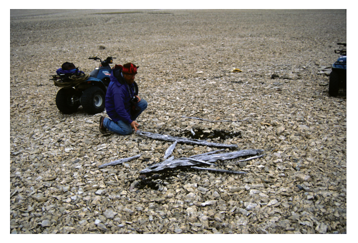
FIG. 3. ObPk-11: Scatter of two runners, six cross slats and two sled shoes. Wood cross slat dated to 790 \pm 50 BP.

ObPk-5 : Six cross slats and four pieces of sled shoe fashioned from caribou antler (Fig. 2) occur here (Table 2). The slats in this and the other komatiks are tapered on each end to about 1/3 to 1/2 of the maximum width. They have