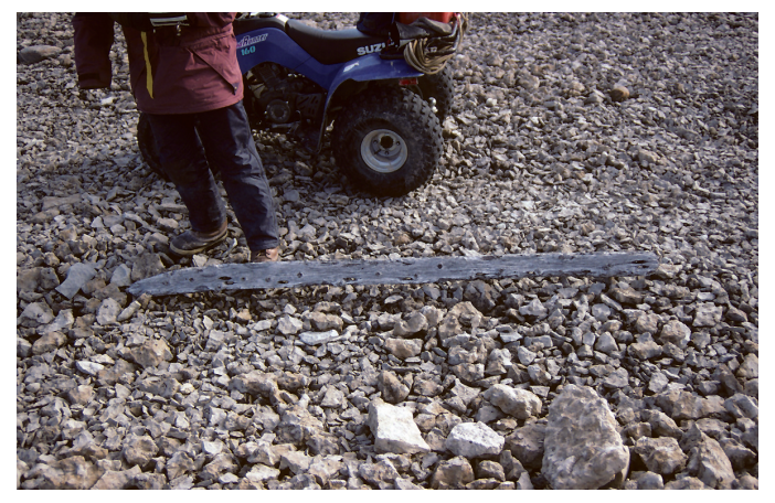
FIG. 9. Neoeskimo sled runner observed at Cape Stang, northeastern Victoria Island.

Otherwise, Stefansson (1929:337) in 1911 noted "numerous fragments of sledges all the way from Crocker River west..." along the mainland coast. However, we found only five sites with such remains in our surveys of western Victoria Island, despite recording hundreds of archaeological sites. Furthermore, we found no such remains in equally