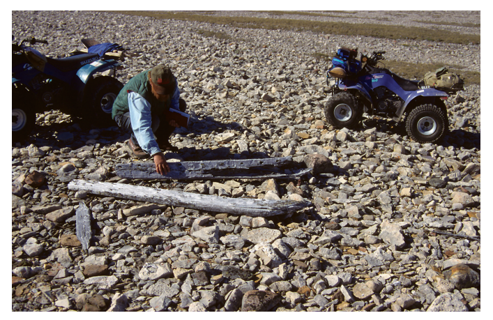
FIG. 8. NhPk-9: Two sled runners and one of the five cross slats at this site. The larger of the two runners dates to 300 \pm 50 BP.