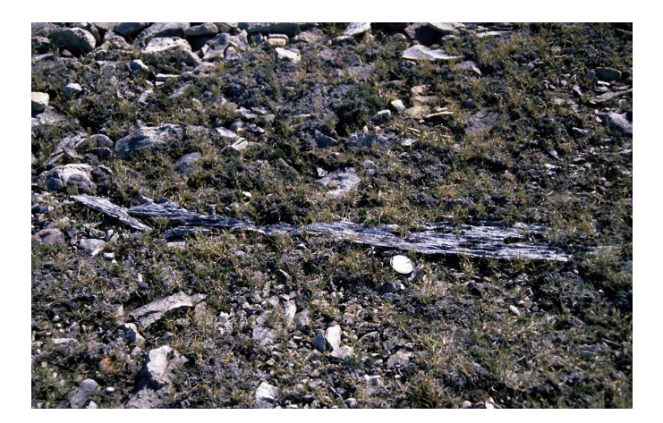
FIG. 6. ObPf-3: One of two sled runners at this site, dated to 580 \pm 60 BP.