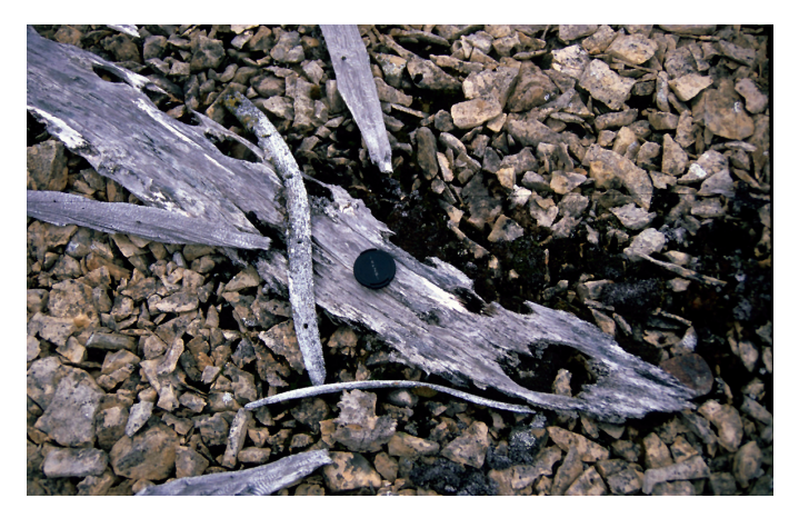
FIG. 4. ObPk-11: Close-up of sled runner, cross slats, and sled shoe with drilled holes. Note the tapering and slight notching on the ends of the cross slats. Camera lens cap provides scale.