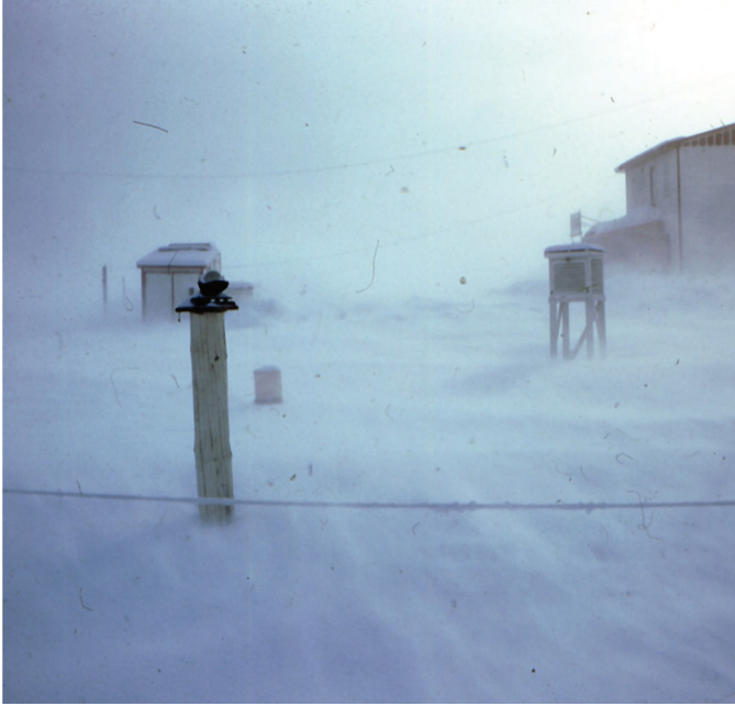
FIG. 5. The Lab on the right, with the instrument “enclosure” in the foreground.

elsewhere, stimulated interest in the Lab and student applications from around the world, for many years.