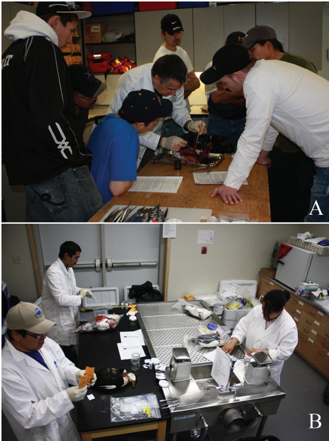
FIG. 3. A) Workshop space at Nunavut Arctic College used from 2007 to 2009. B) New laboratory facilities built with federal funding in 2010.