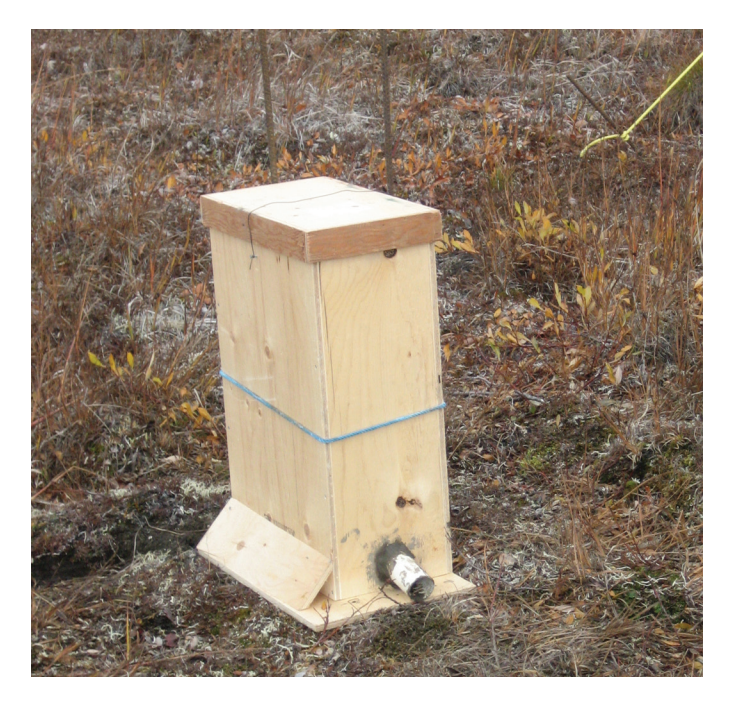
FIG. 1. Picture of a trapping box on Herschel Island.

lemmings (7/40), brown lemmings (2/40), or both species (4/40), but only brown lemmings used the boxes in 2011. Signs of reproduction were found in one box in 2011 and none in 2010. Winter nests were also found near 15 boxes in 2010 and 19 boxes in 2011. Stoats ( Mustela erminea ) used some boxes (1/40 in 2010 and 4/40 in 2011) to store lemmings they had killed in the surrounding area or, in one case, the lemmings occupying a nest built inside a box. No lemmings were caught in the boxes in spring, despite all the sign of winter use and even though lemmings were at high densities during both winters (G. Gauthier and F. Bilodeau, unpubl. data).