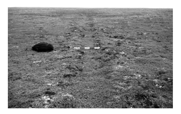
FIG. 4. Polar bear trails paralleling the coasts remain evident on St. Matthew Island, though unused for more than a century. This trail on an old beach ridge is overgrown with crowberry ( Empetrum nigrum ) (Photo: D.R. Klein, July 2005).

None of these logbooks indicated any attempt to put crew members ashore to hunt polar bears or reported any interest in doing so, although knowledge that bears were present on these islands was often noted when the islands were sighted. When in the vicinity of the St. Matthew Islands at the beginning of the whaling season, whalers were preoccupied with hunting whales at the edge of the receding ice. They could not risk losing time for hunting and processing whales by putting crew members ashore for recreational hunting of polar bears, nor could they risk their ships' becoming stuck in the ice that tended to aggregate close to the islands at that time of year. During the return to their home ports with their valuable cargos, time was also of the essence for those awaiting a return on their investments in the whaling voyages, which included the captains and crews of the whaling ships (Bockstoce, 1986).