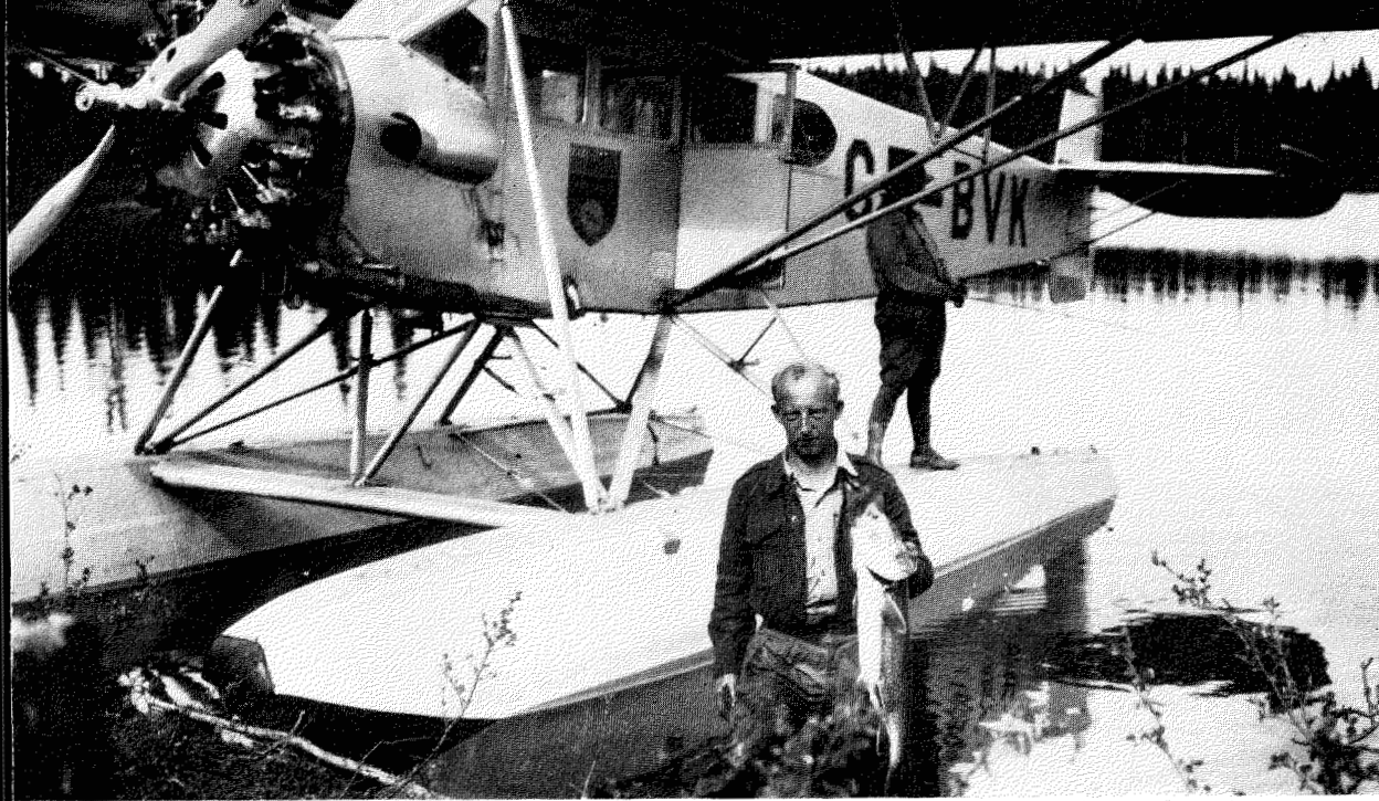
Fishing in Wishart Lake: in foreground 12 lb. lake trout.