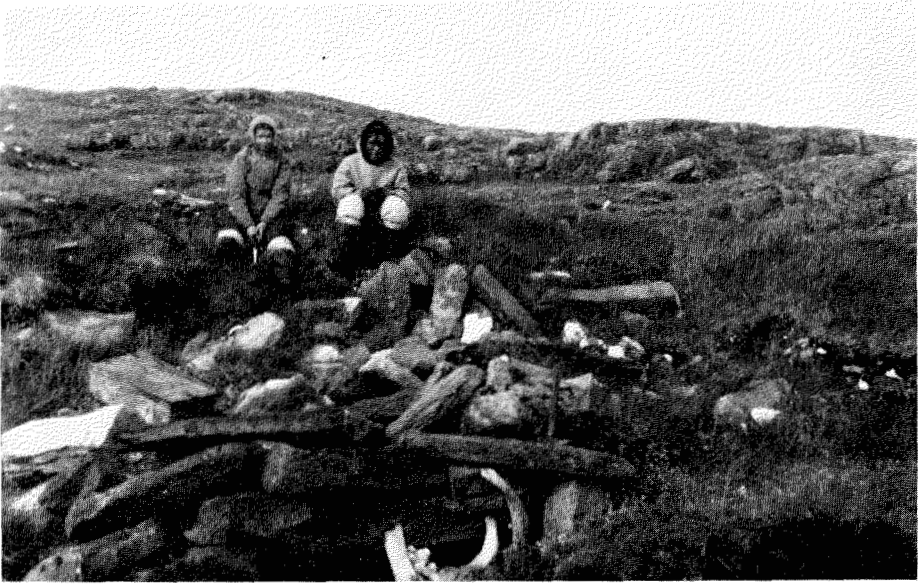
One of the younger Nuwata houses before excavation, August 1938. The porch roof is still intact.