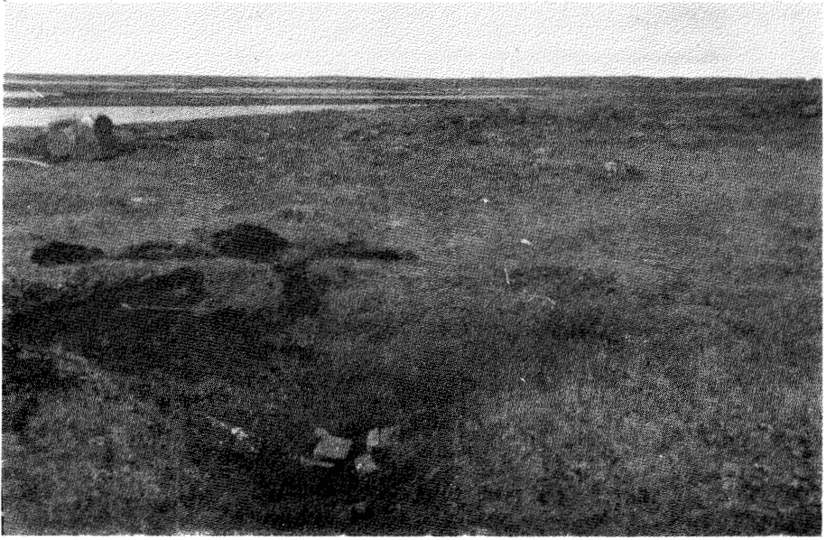
One of the oldest Nuwata houses during excavation, August 1938.

group, of two houses only, was about 15 feet higher. We dug twelve of the twenty-two houses, which apparently varied greatly in age. When we were there the porch roofs were still intact on the youngest houses, which did not appear to be much over one hundred years old. Several of the Nuwata houses, as well as those at Storm Cove, had been disturbed recently by the local Eskimo digging for curios to sell at the trading posts. In addition, they had removed most of the long whalebone roof supports for sledge shoeing and other purposes. The Storm Cove ruins were about a quarter of a mile inland and 50 feet above sea level. There were five houses, all somewhat older than the youngest houses at Nuwata. Of these five, three were excavated.