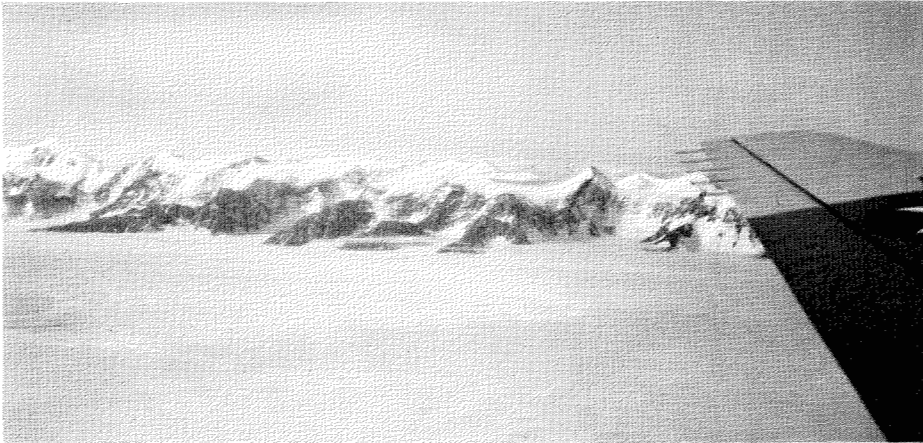
Fig. 2. View over Rennick Glacier. Eastern limit is defined by prominent mountains, background.

On the west, the glacier is bounded by relatively low lying and widely spaced mountains and nunataks, that separate it from the Victoria Land Plateau proper, thereby defining an irregular limit on that side of the glacier. These mountains appear to be geologically different from those found on the eastern side (Fig. 2.), where the glacier is sharply delineated in a comparatively straight north-south line. The mountains there