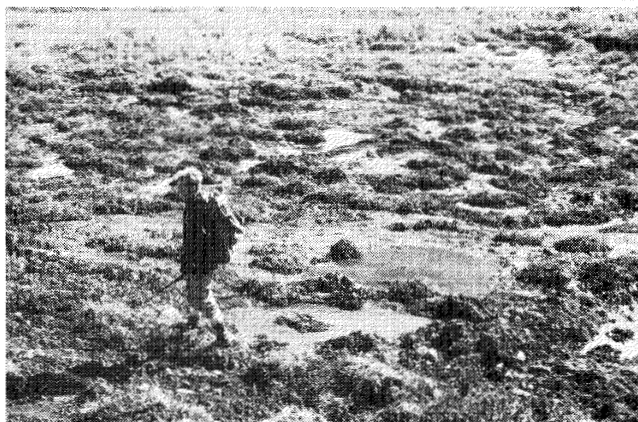
FIG. 4. Area immediately below mudflow scar. Isolated islands of vegetation are left during the down slope movement of the fluid soil. Water-logged exposed silty soil dominates the area.