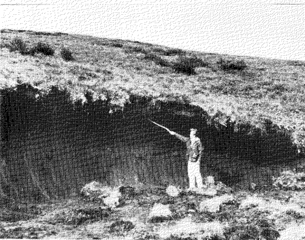
FIG. 2. Massive mudflow scar on slope at approx. 1,400 feet south of Canoe Lake. End of stick indicates surface of permafrost table.