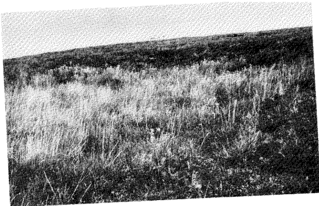
FIG. 6. After one or two years the silty soil is covered by vegetation. On the upper more hydric (seepage) area below the scar, Senecio congestus and Eriophorum scheuchzeri dominate, whereas on the drier areas below Calamagrostis canadensis forms the major cover..

The position of every mudflow around Canoe Lake was clearly marked by a long depression and terminal pile of debris on the lake shore. The continued occurrence of such down slope movements could lead to a buildup of lake sediment, possibly cut off drainage outlets and lead, in time, to the obliteration of the lake.