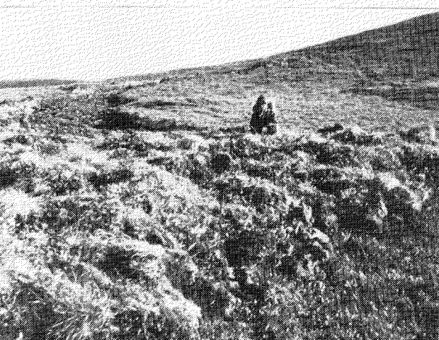
FIG. 3. Irregular mounds of soil and vegetated turf at base of slope where flow stops.