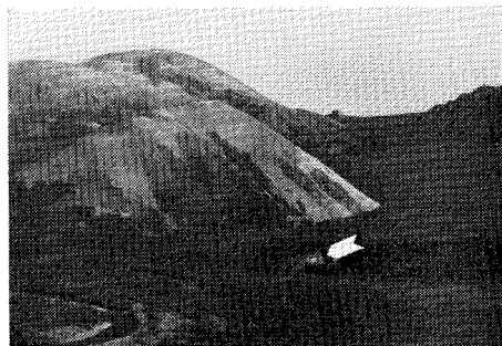
FIG. 2. View northwest across Cutaway Creek to skeleton exposure (arrow).