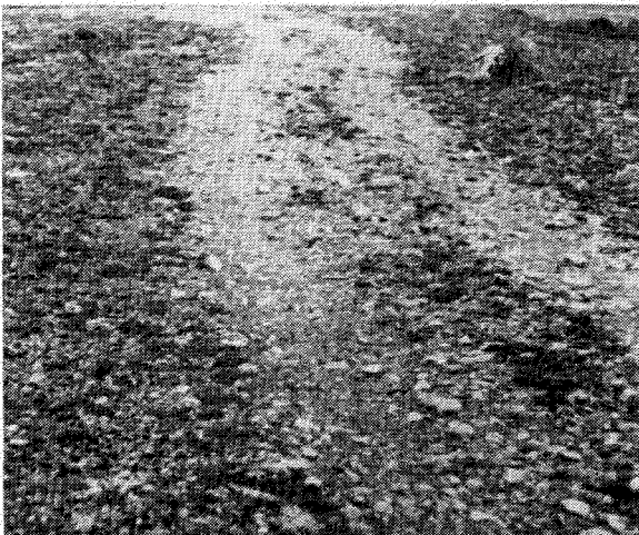
FIG. 2. Vehicle track along the surface of a raised beach crest. Lighter colour results from sandy material exposed after removal of the lichen mat and vascular plant cover.