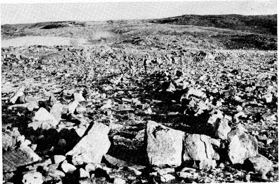
FIG. 2. Large rectangular Dorset structure on Site SgFm-3.

The Dorset period was represented on site SgFm-3 near Koldewey Point (Fig. 1). The site was rendered prominent by the presence of a large (approx. 40m x 4m) rectangular, boulder-walled, enclosed structure (Fig. 2). Other less clearly defined stone walls indi-