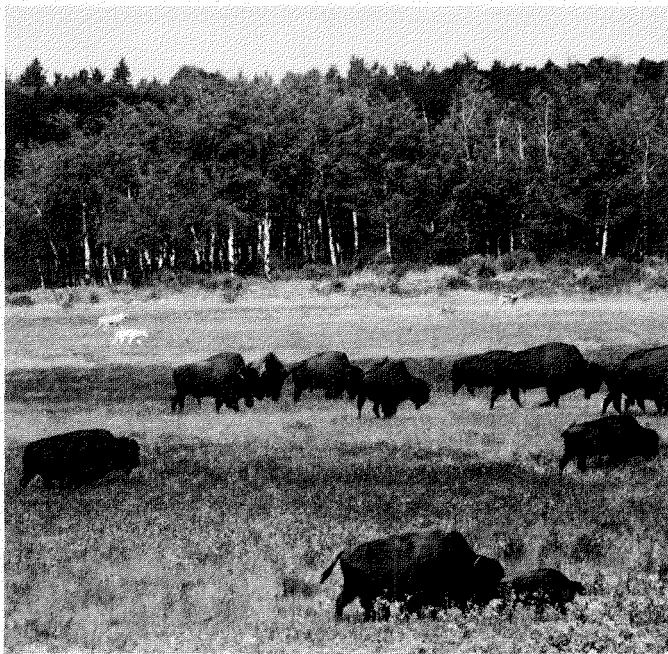
FIG. 2. A pack of wolves in association with a herd of bison at Lake One. Bison not under attack by wolves appear to pay very little attention to the presence of wolves.

Wolves are natural predators of wood buffalo (Fig. 2), and a program of the Canadian Wildlife Service to reintroduce wood bison in northern areas of Canada beginning in 1975 (Reynolds et al. , 1982) resulted in an increase in the number of sites where wolf predation on bison could occur. Thus, the wood bison rehabilitation program generated increased interest in the dynamics of wolf-prey interactions.