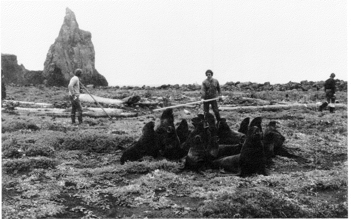
FIG. 2. Photograph showing a group of juvenile and adult northern fur seals on Bogoslof Island during 1983. The animals were sexed, counted, and released. Castle Rock is visible in the background.