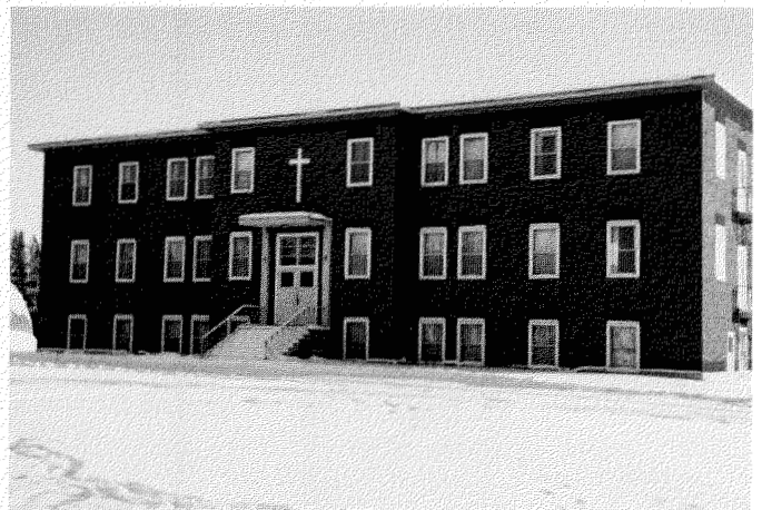
Girls' residence at Grandin College.